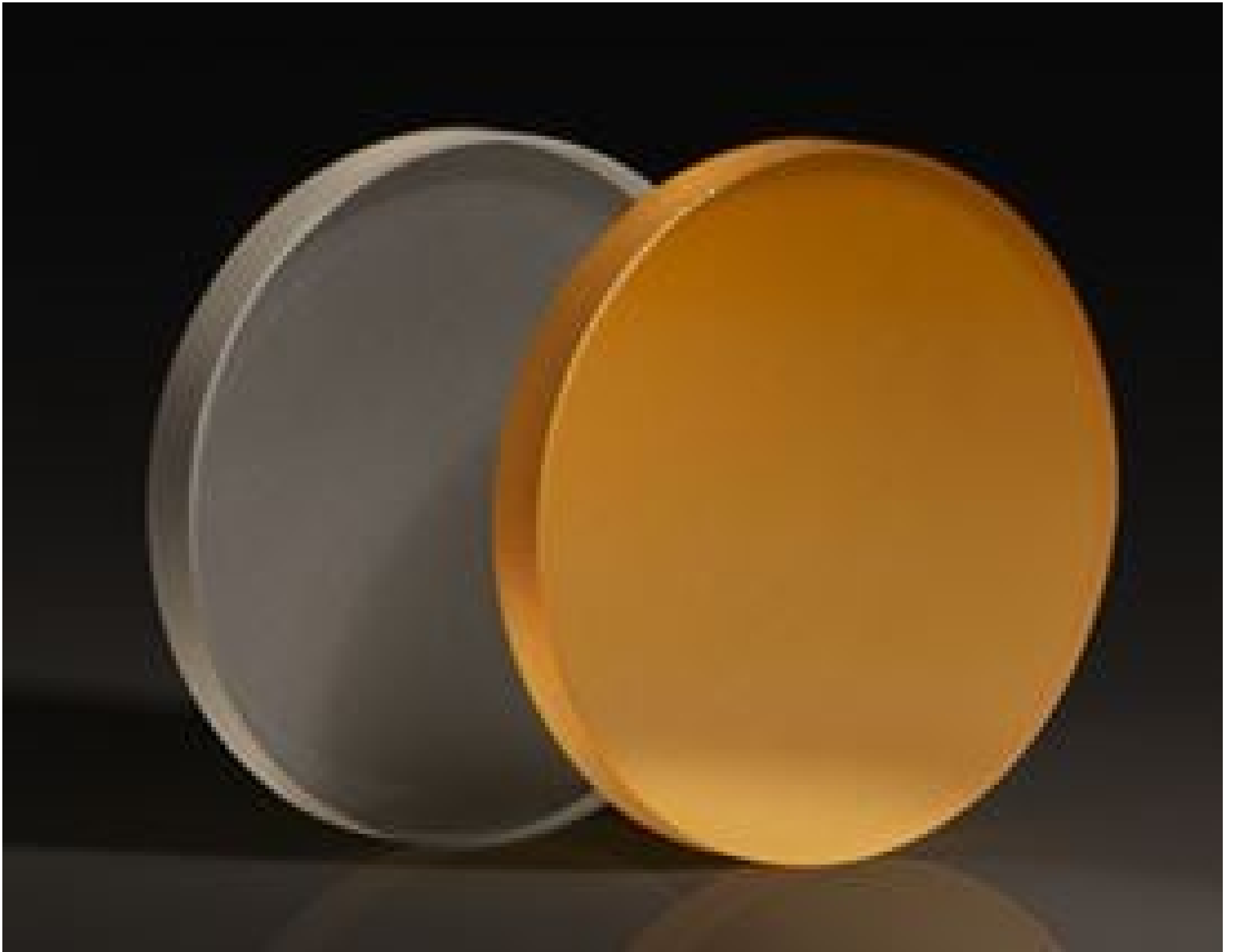
Infrared (IR) Diffusers