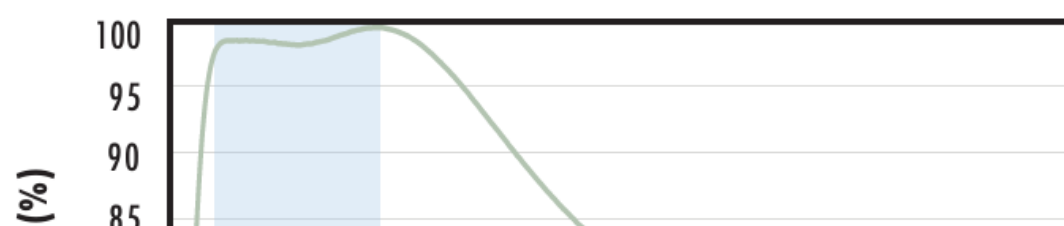
Fused Silica with UV-AR Coating Typical Transmission

Typical transmission of a 3mm thick fused silica window with UV-AR (250-425nm) coating at 0° AOI.