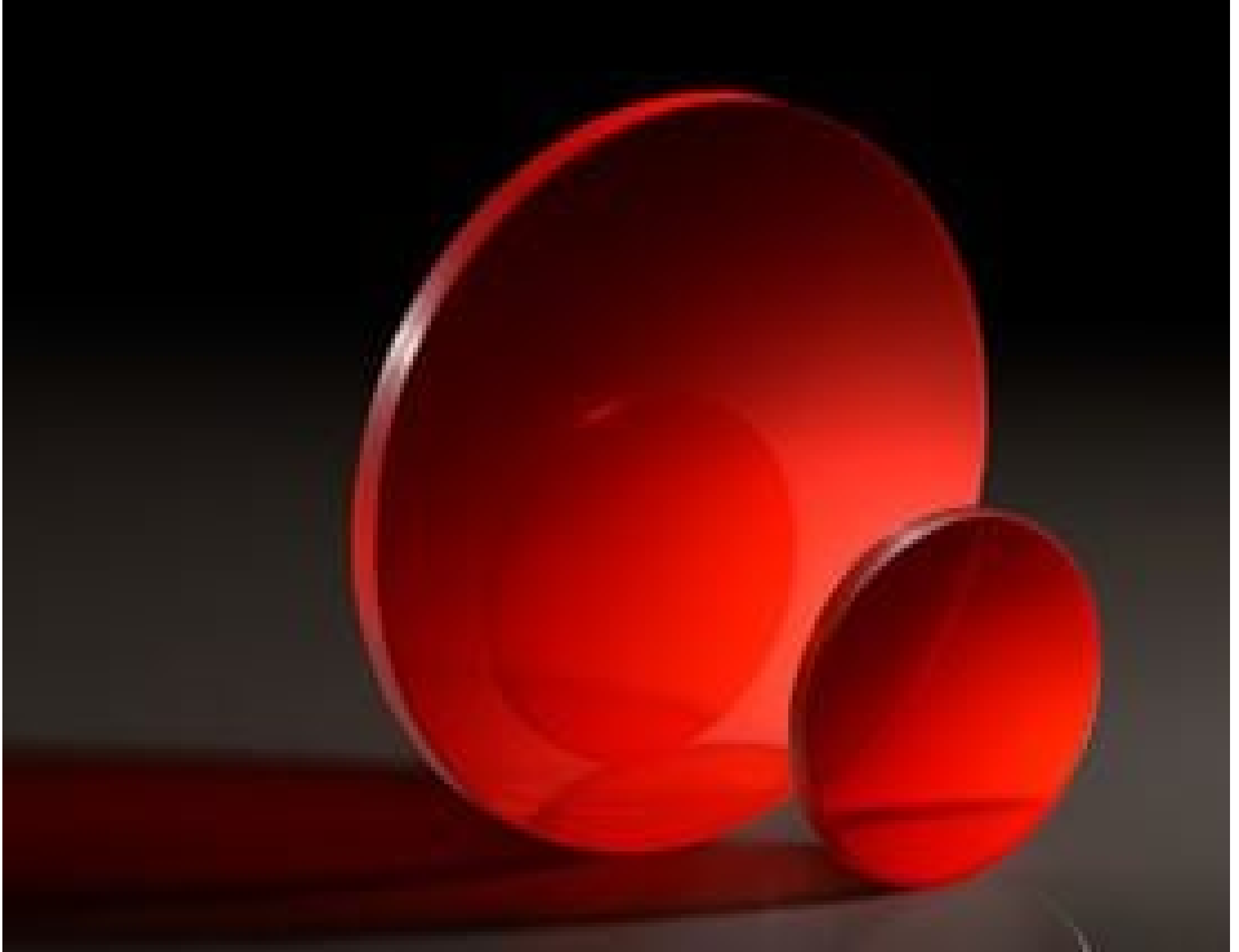
Thallium Bromiodide (KRS-5) Windows