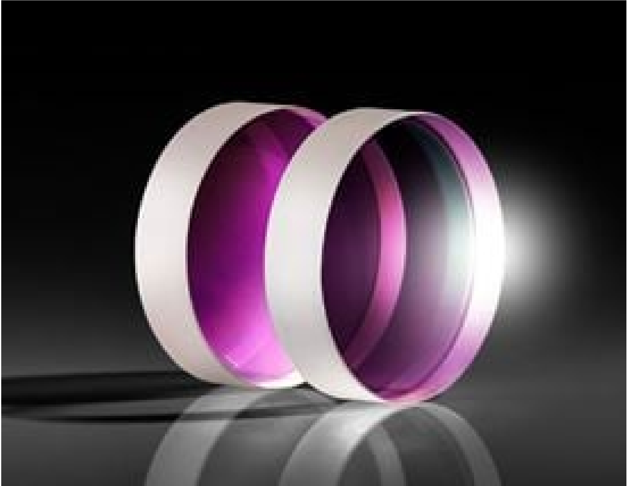
UltraFast Innovations (UFI) Ultra-Broadband Complementary Chirped Mirror Pairs