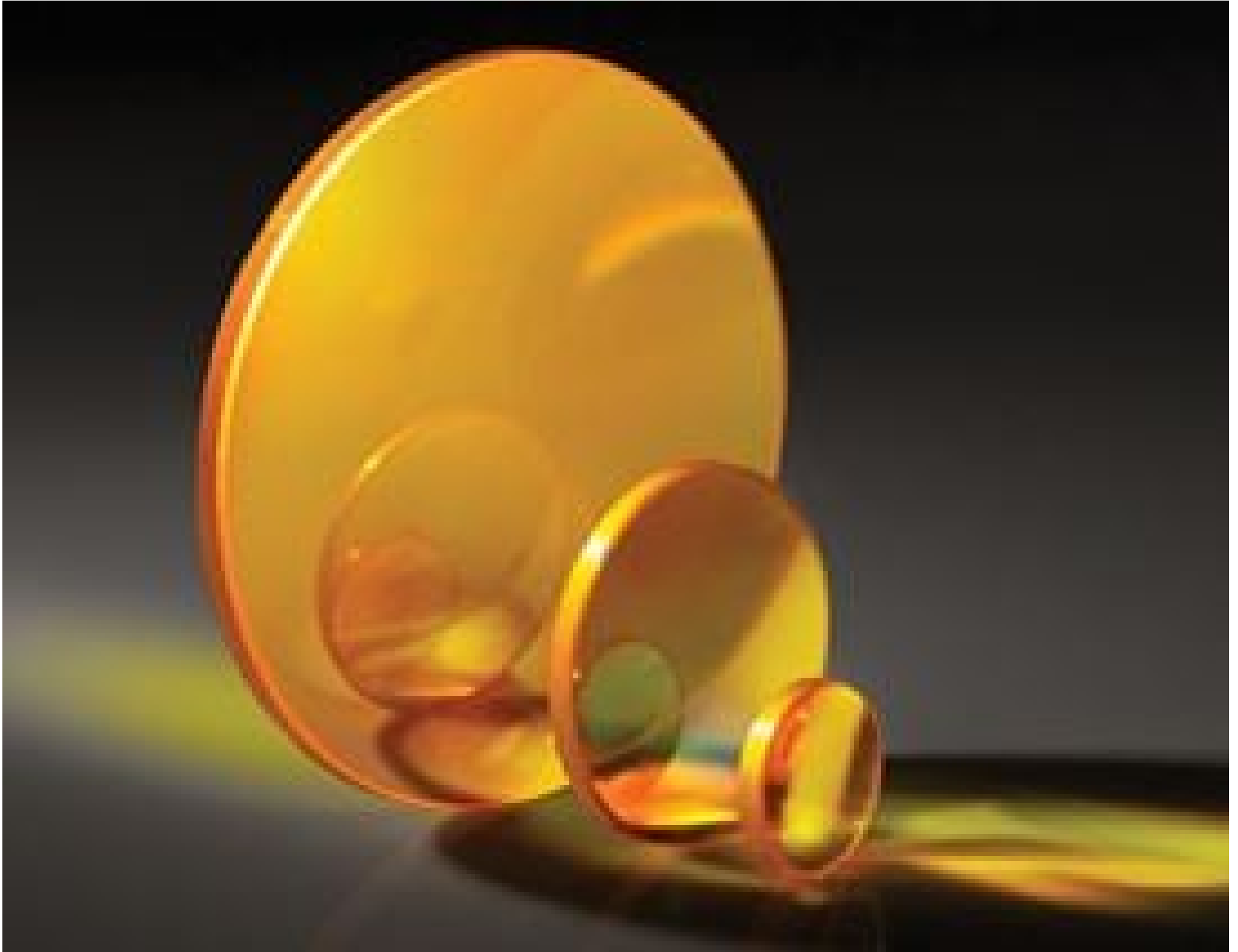
TECHSPEC Zinc Selenide (ZnSe) Plano-Convex (PCX) Lenses