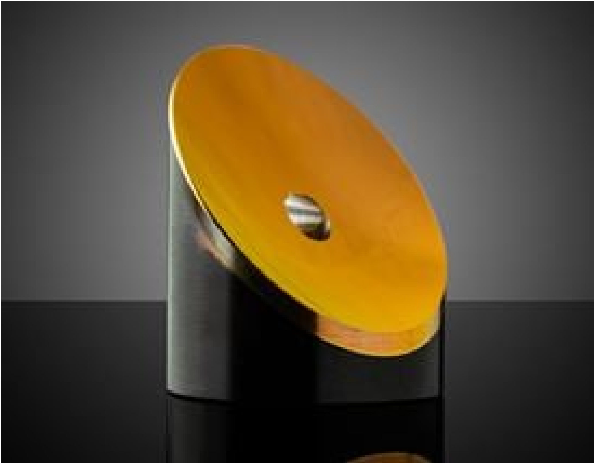
Off-Axis Parabolic Mirrors with Alignment Through Holes