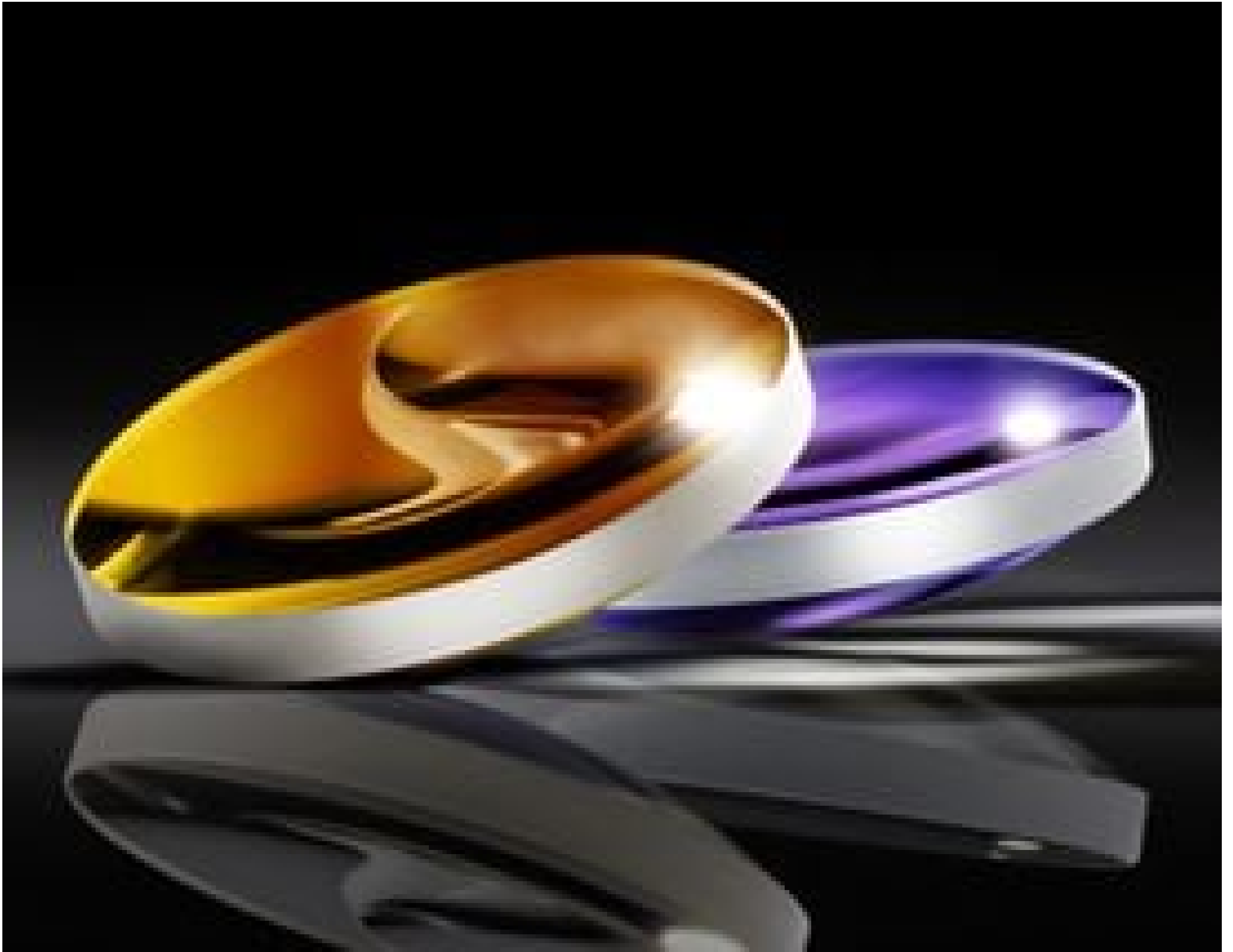
High Precision Laser Grade Aspheric Lenses