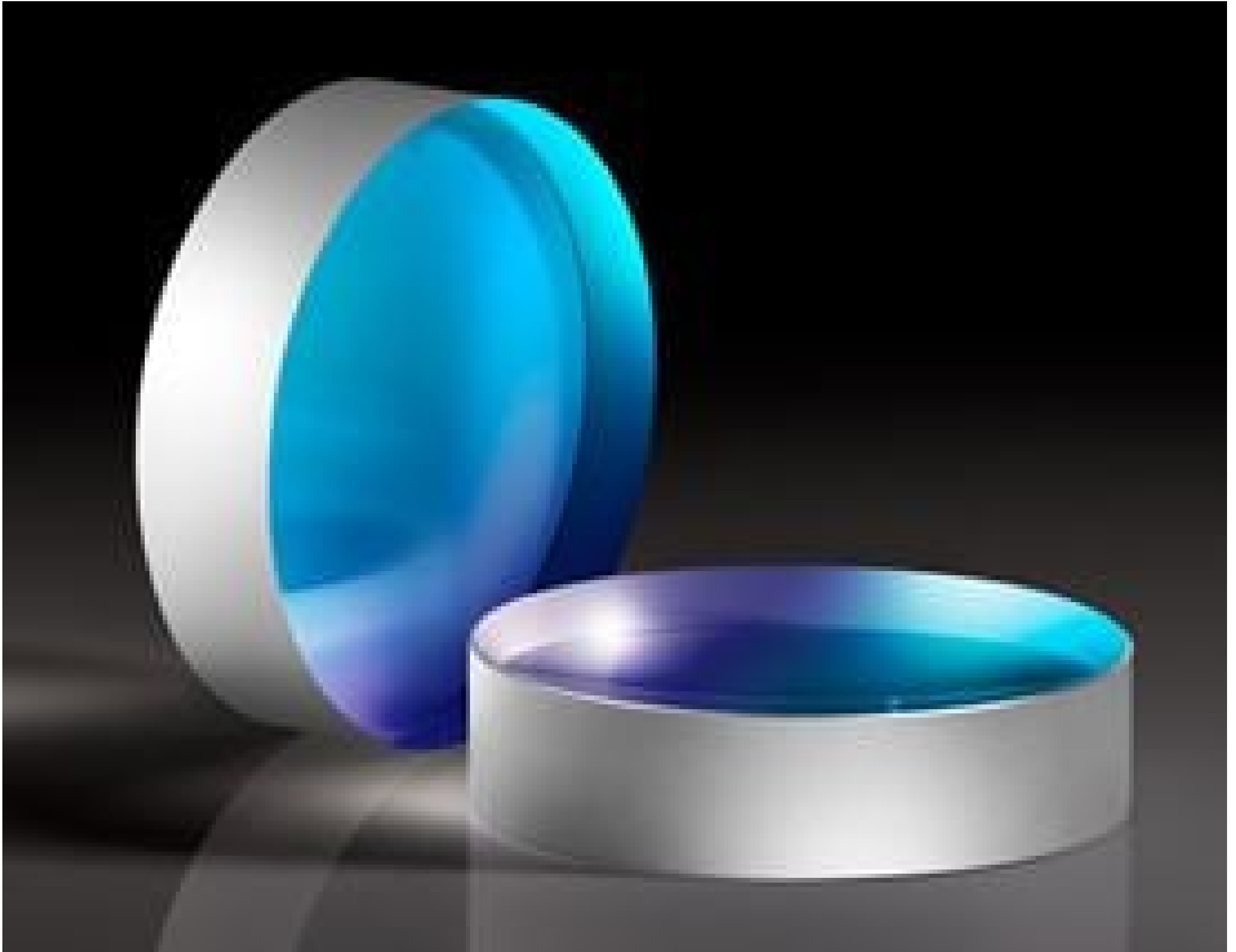
Laser Line Concave Mirrors