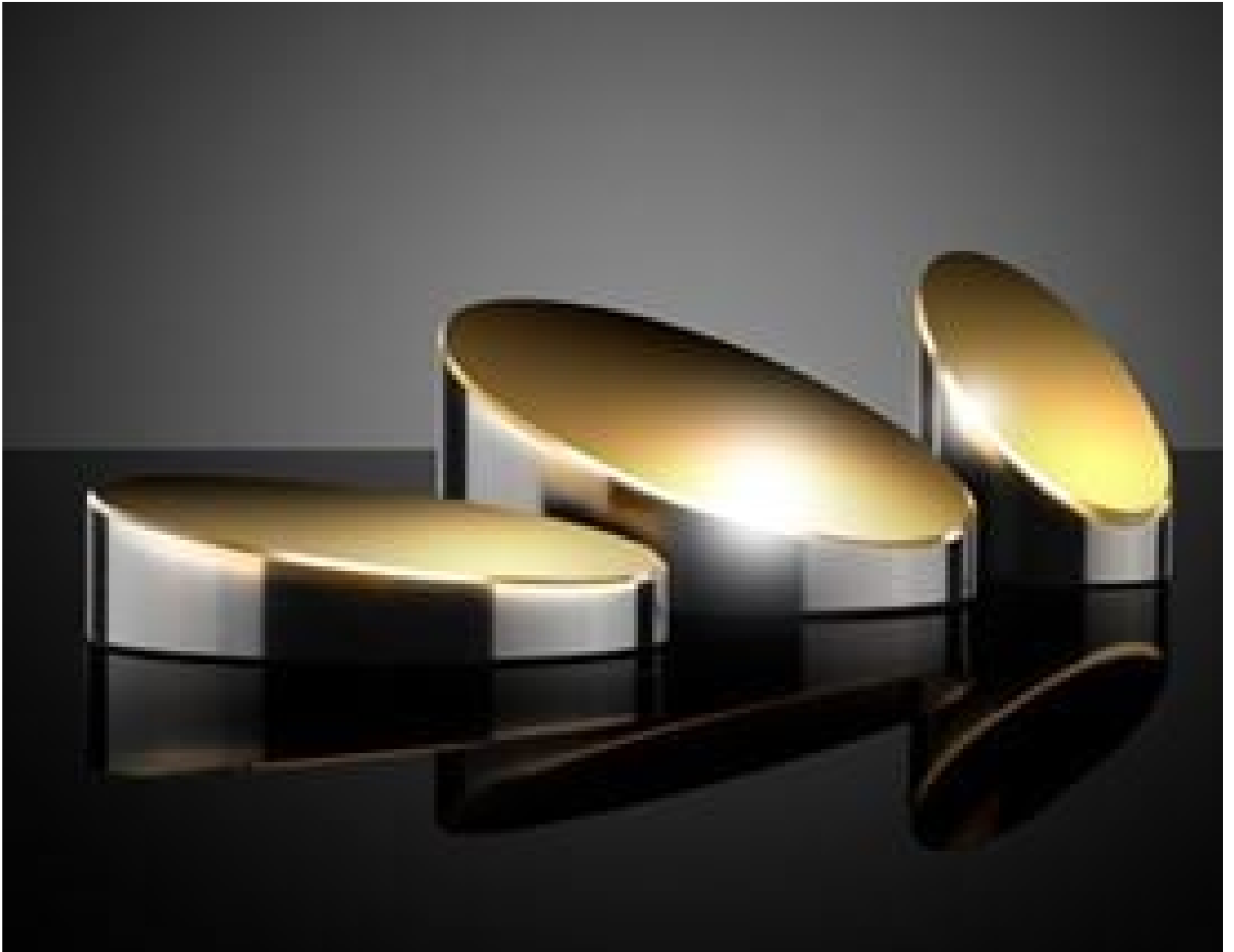
TECHSPEC Gold Off-Axis Parabolic Mirrors