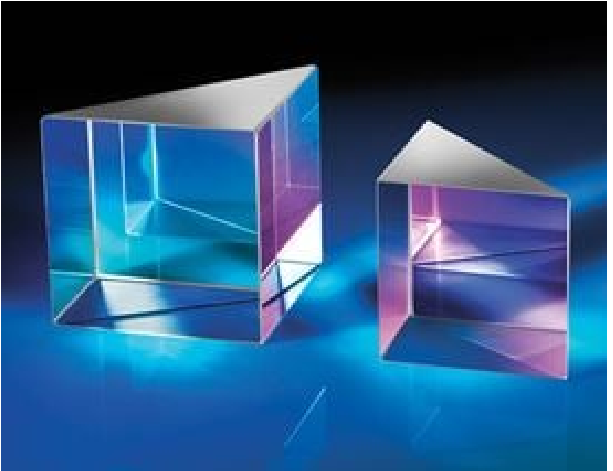
N-BK7 High Tolerance Right Angle Prisms