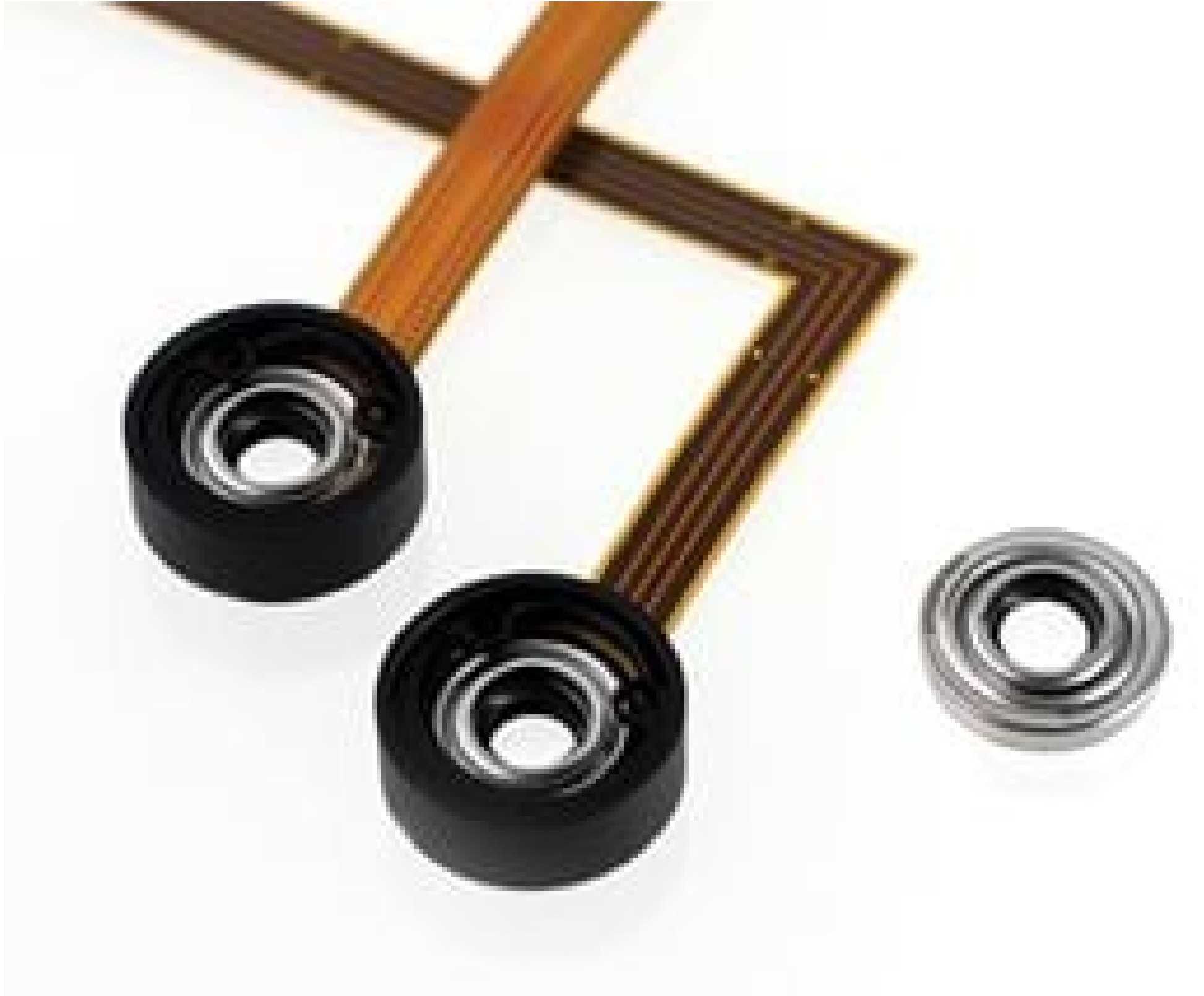
Corning® Varioptic® Variable Focus Liquid Lenses