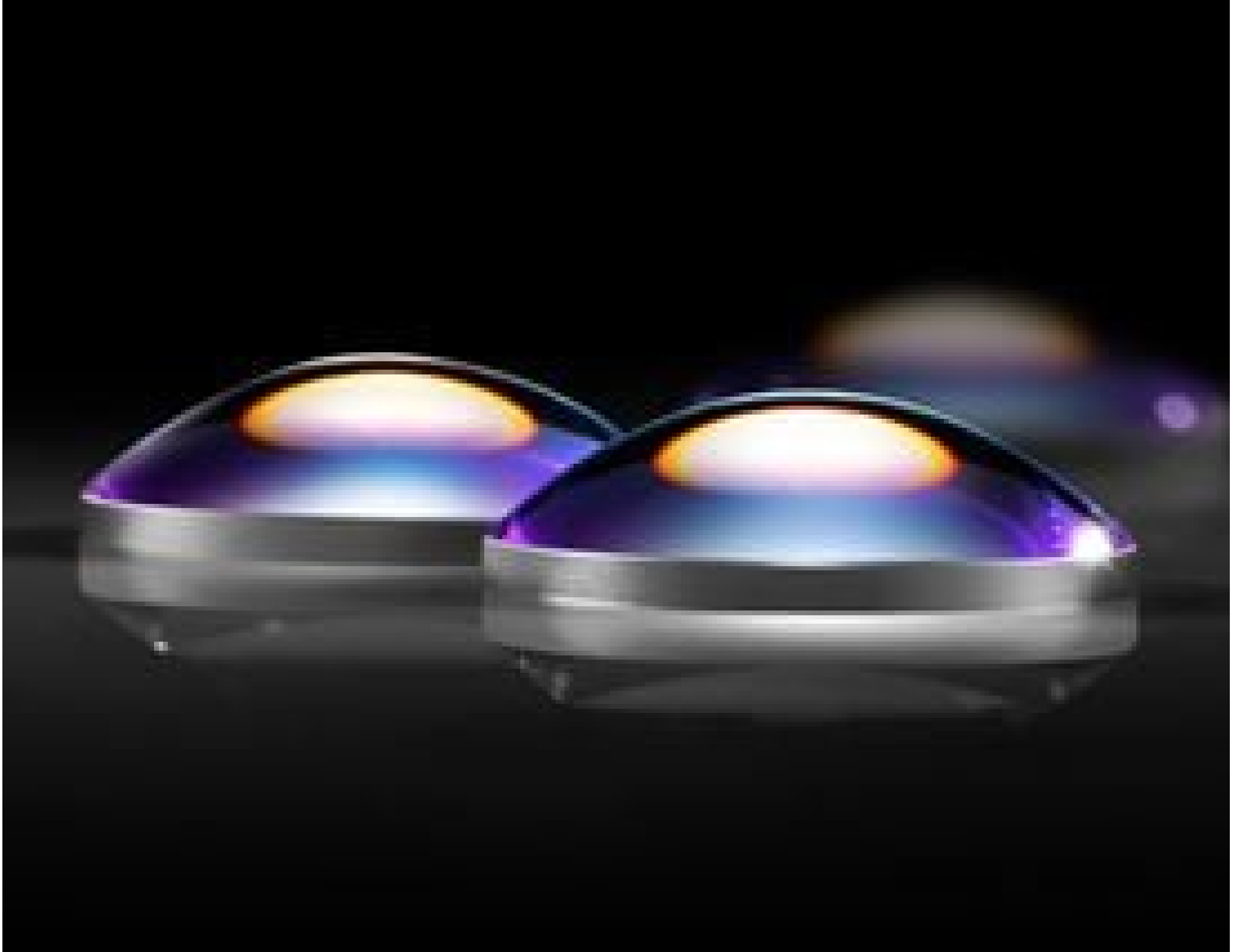
TECHSPEC® Precision Molded Aspheric Lenses