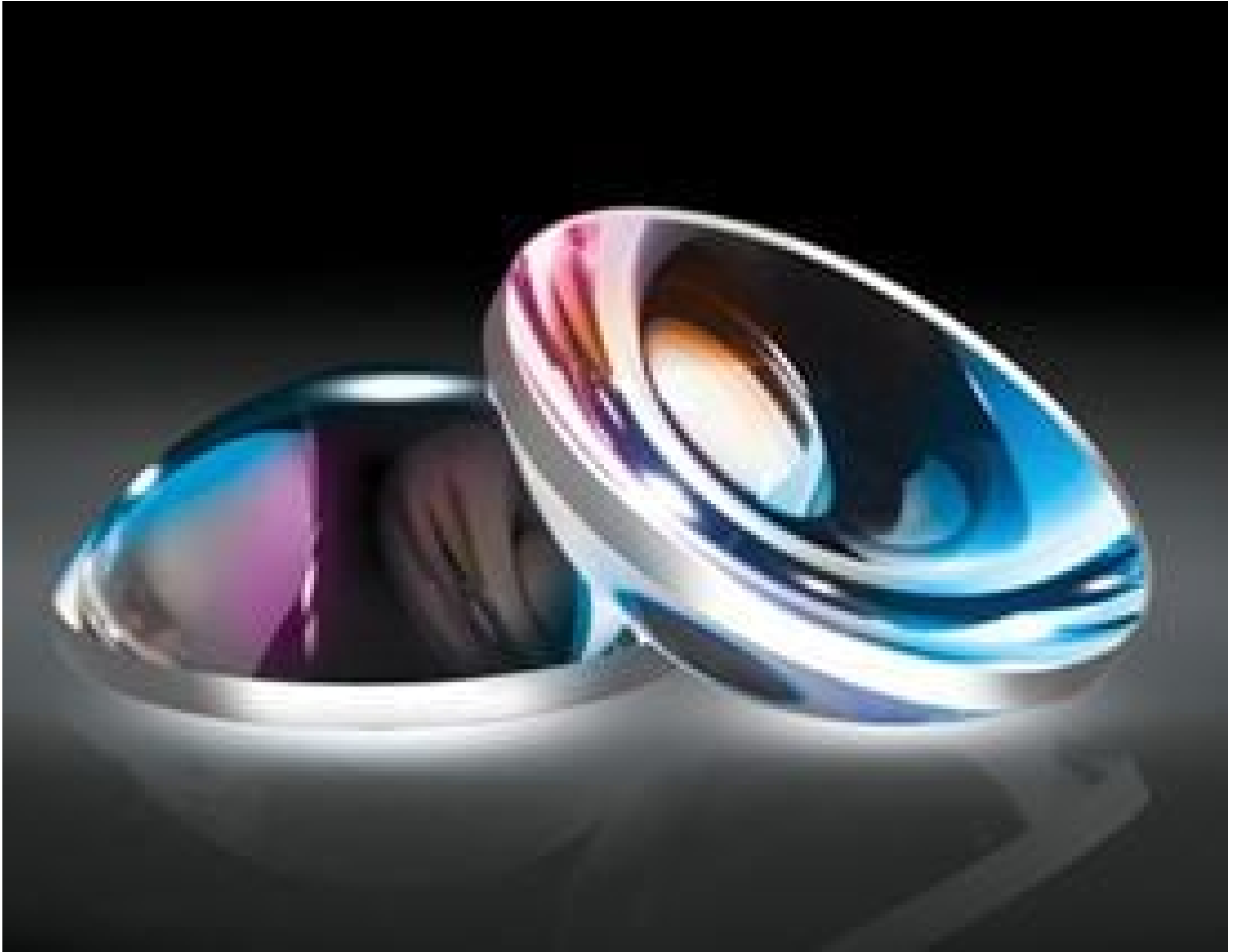
Calibration Grade Aspheric Lenses