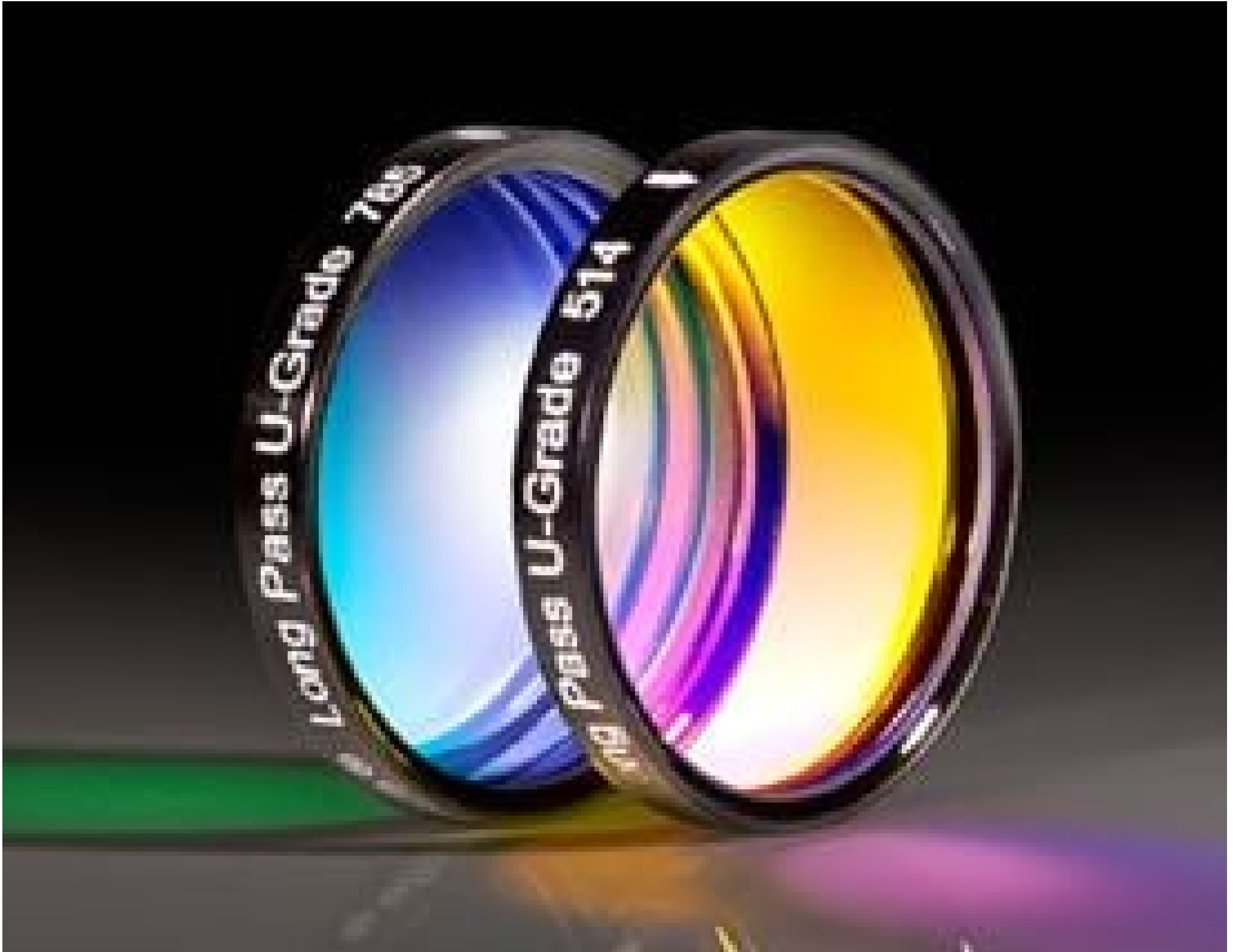
Laser Line Longpass Filters