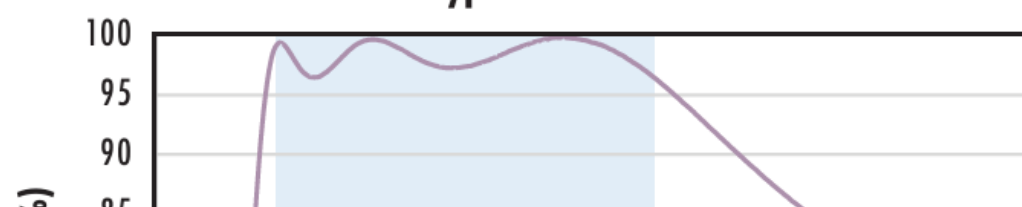
N-BK7 with VIS-NIR Coating Typical Transmission

Typical transmission of a 3mm thick N-BK7 window with VIS-NIR (400-1000nm) coating at 0° AOI.