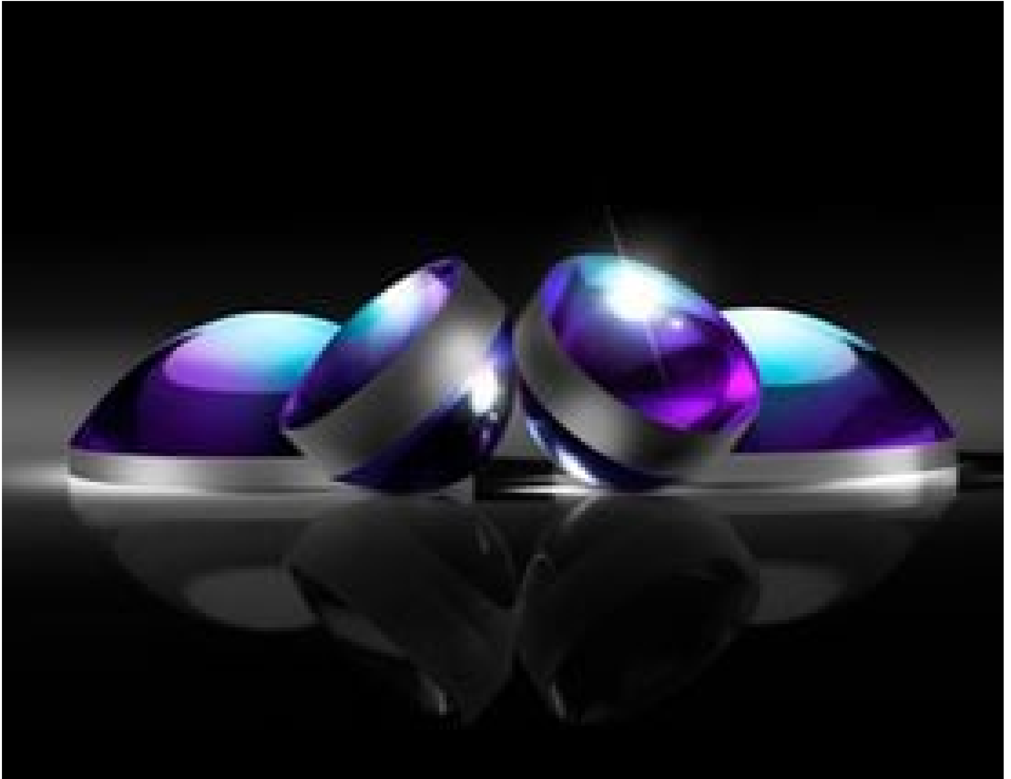
TECHSPEC® Calcium Fluoride (CaF 2 ) Aspheric Lenses