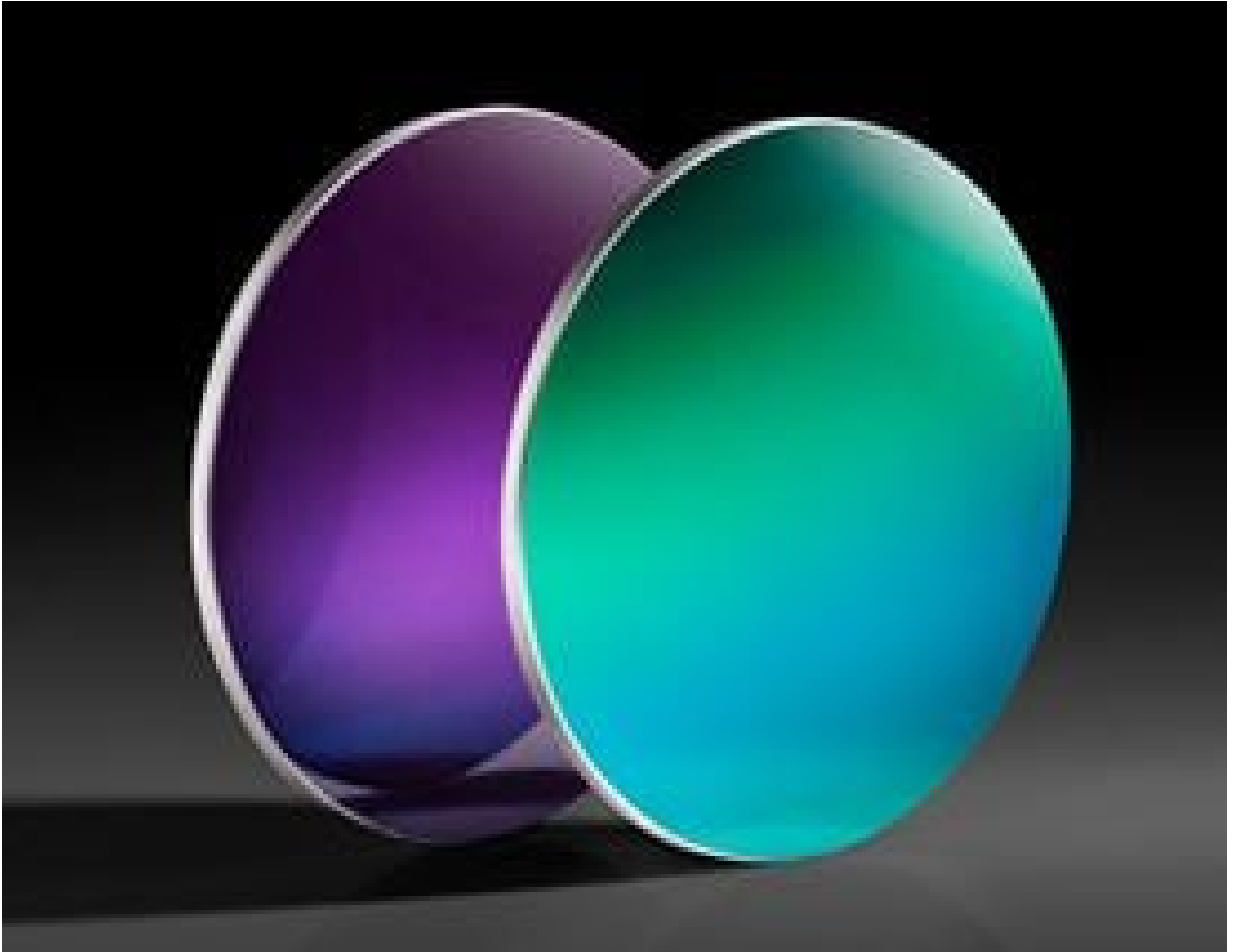
TECHSPEC Silicon (Si) Windows