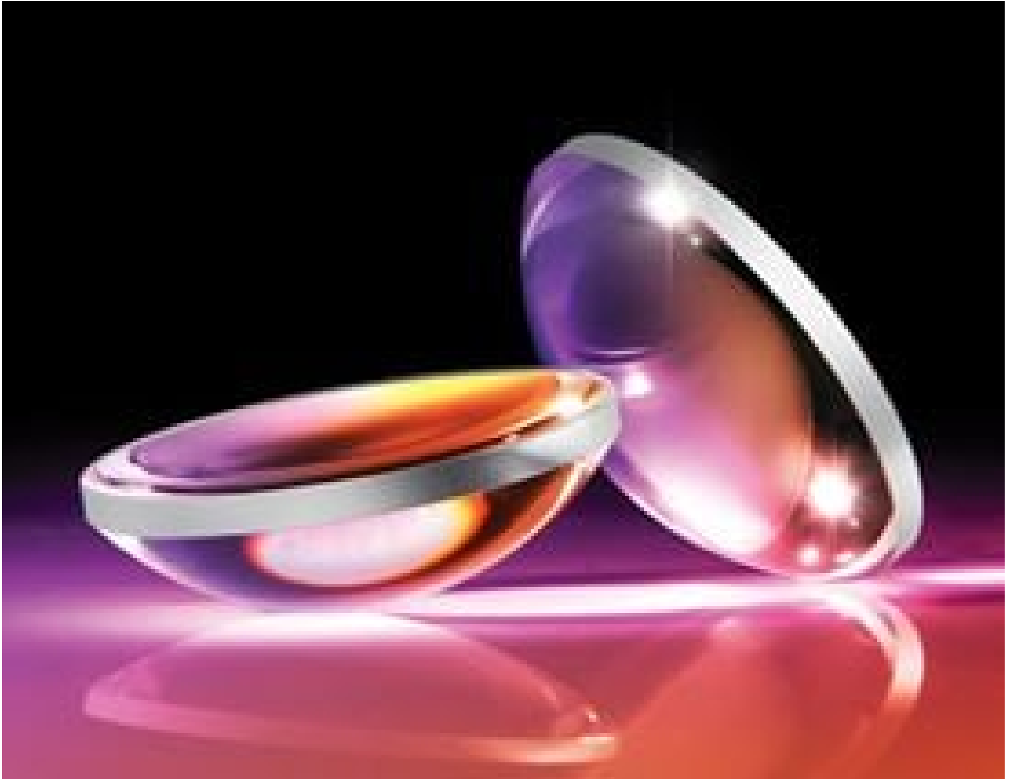
Hyperbolic Aspheric Lenses