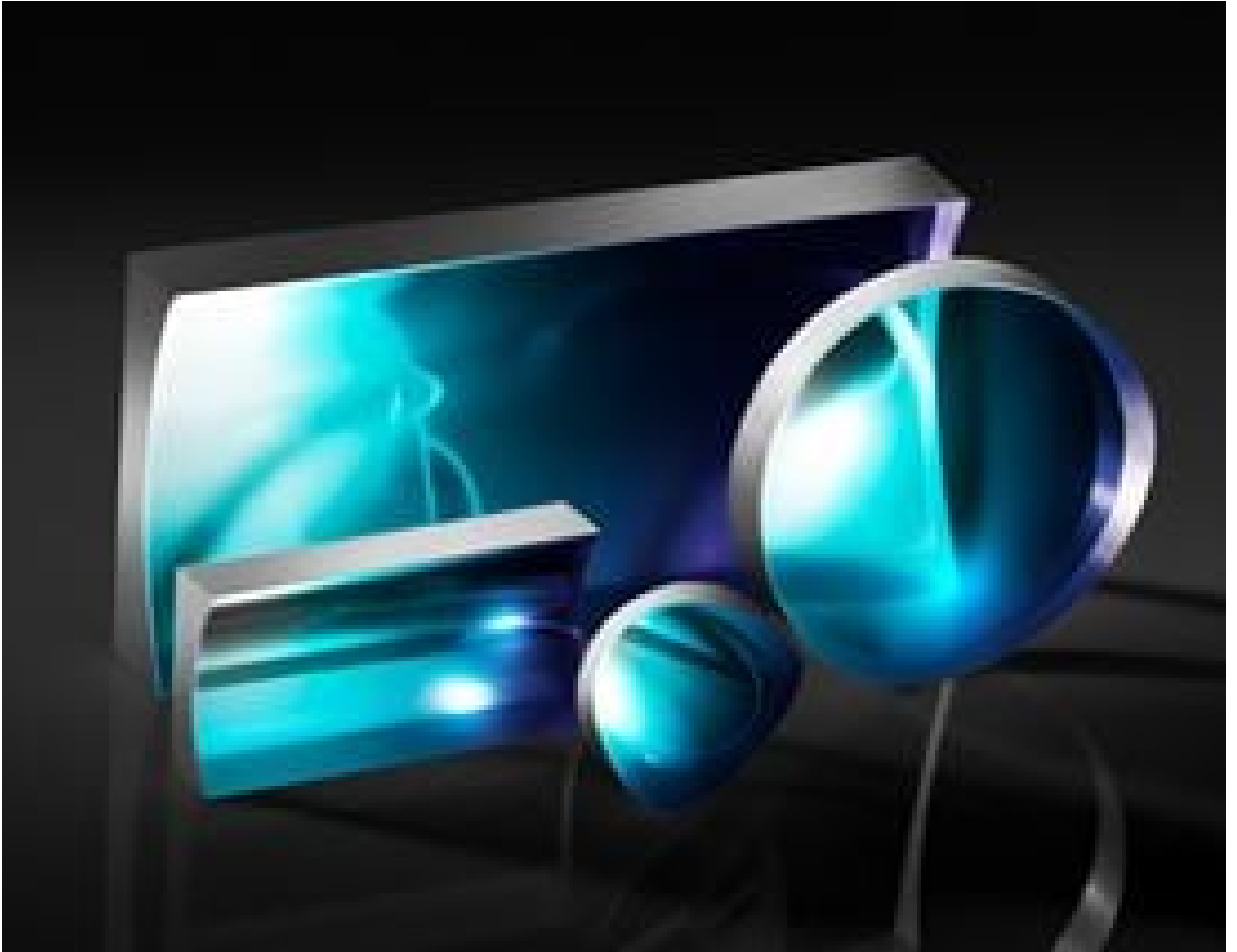
TECHSPEC® Illumination Grade PCV Cylinder Lenses