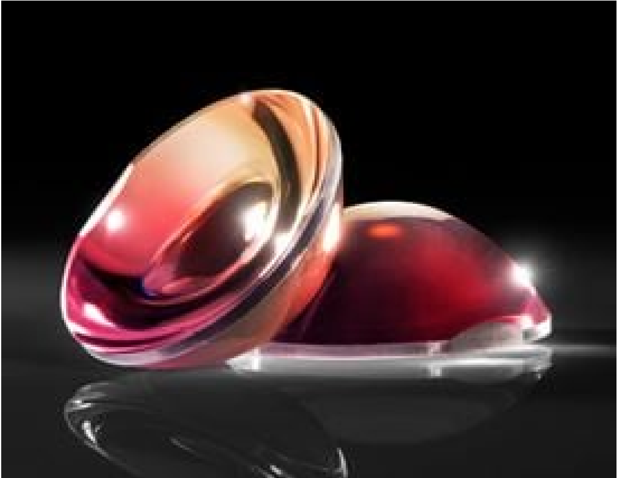
TECHSPEC® Plastic Aspheric Lenses