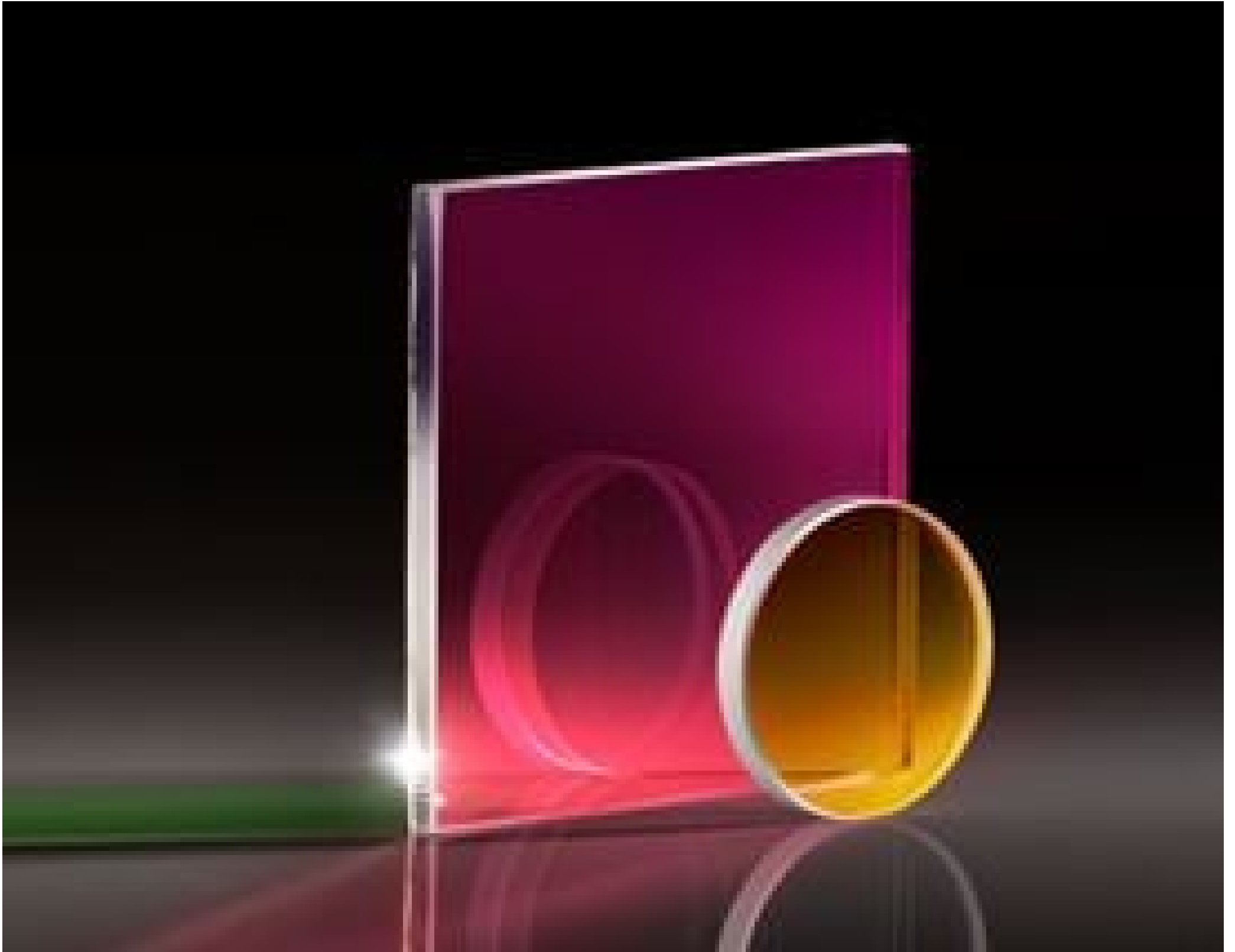
Extended Hot Mirrors