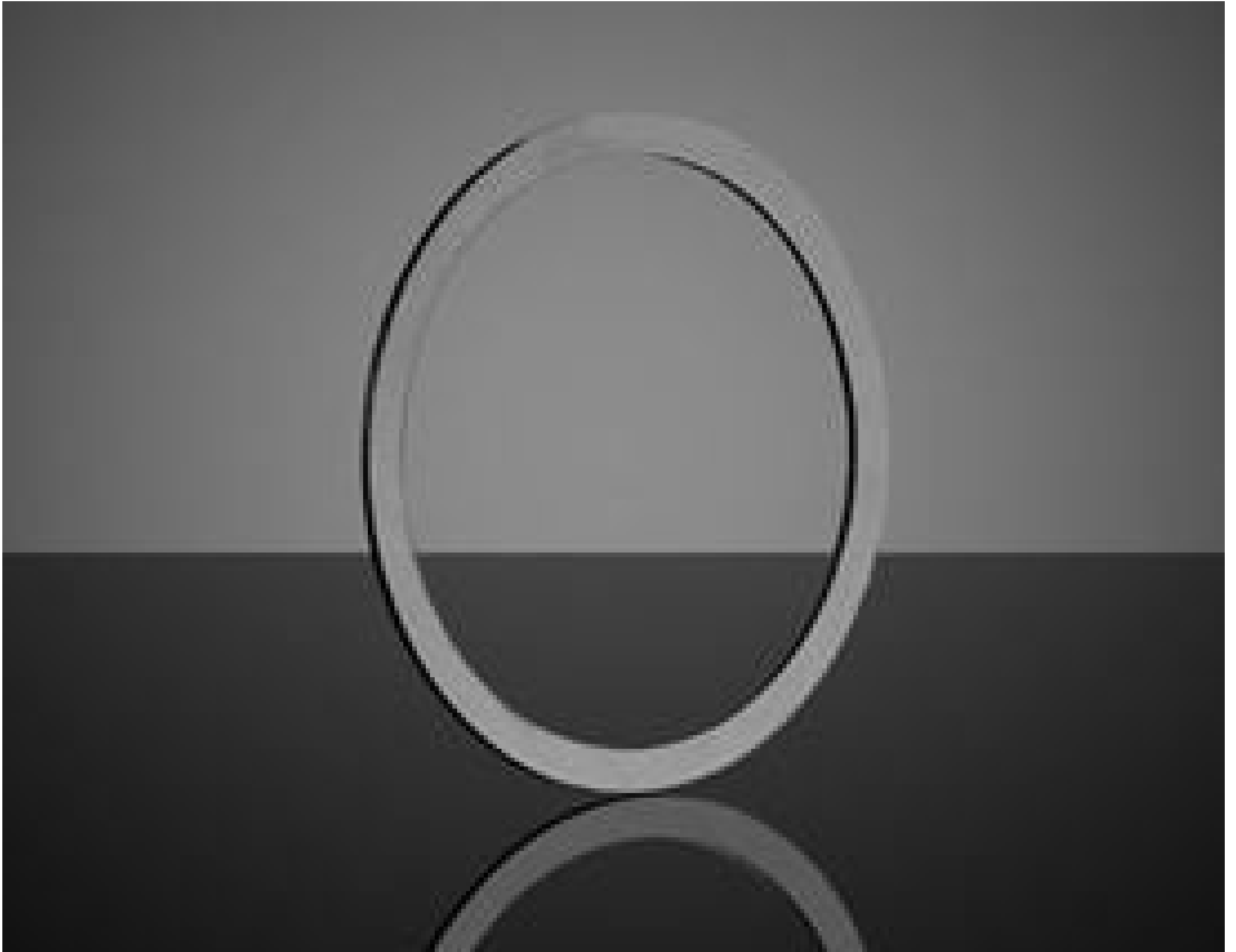
TECHSPEC Multi-Element Spacer Ring