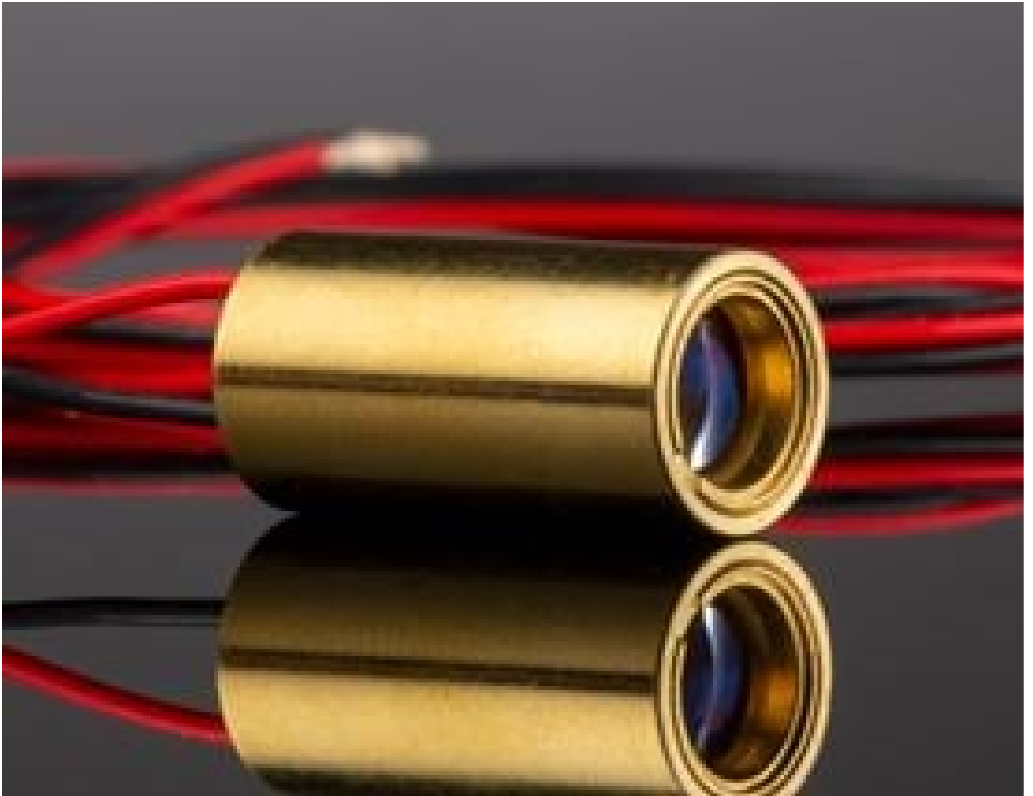
Coherent® Micro VLM™ Laser Diode