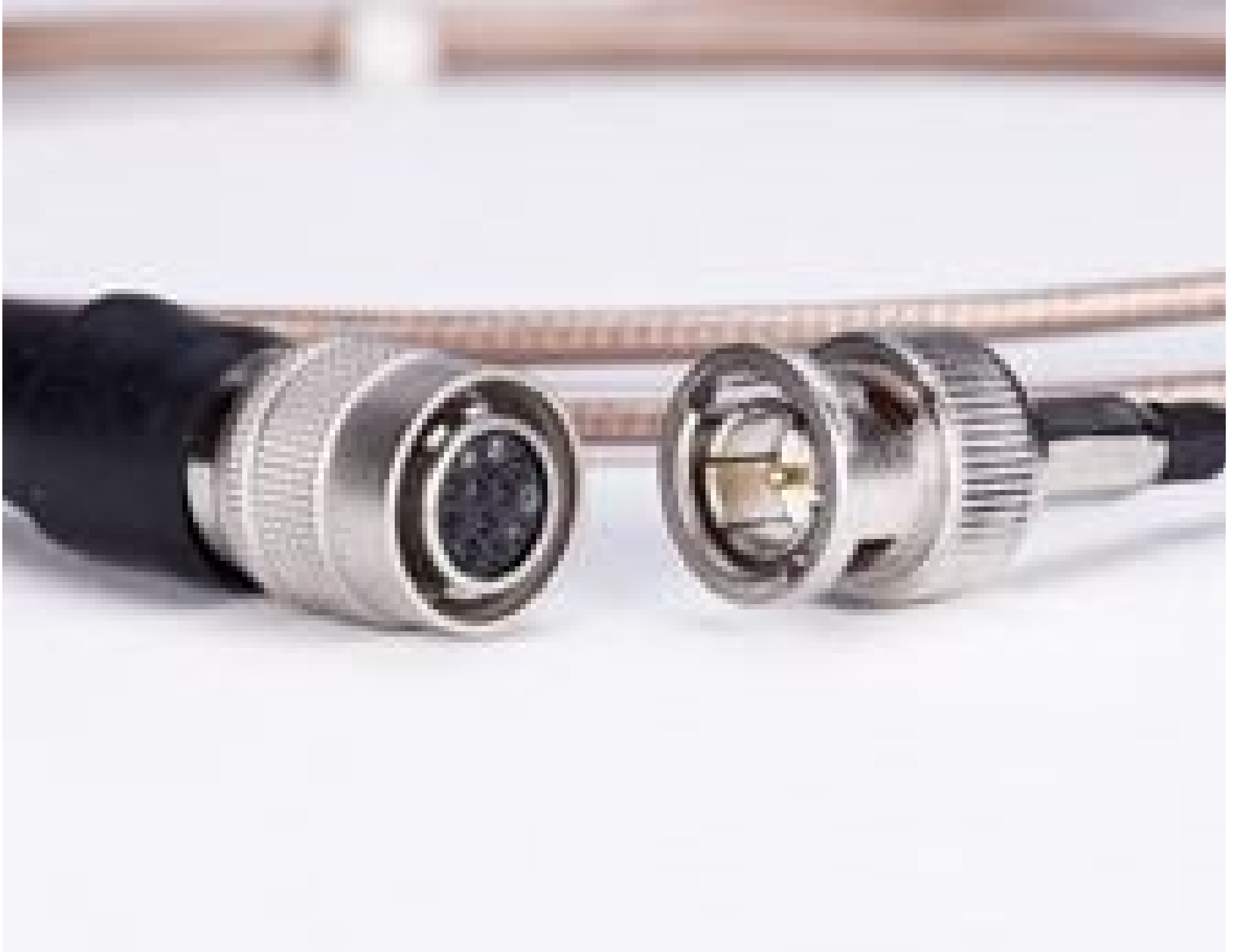
2m Trigger Cable with BNC Connector, #88-367