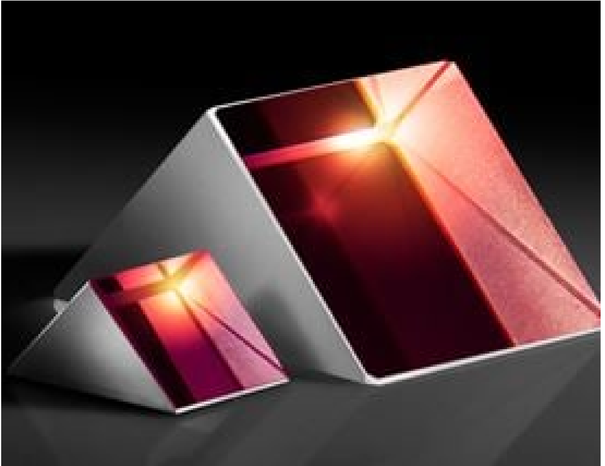
N-SF11 Right Angle Prisms