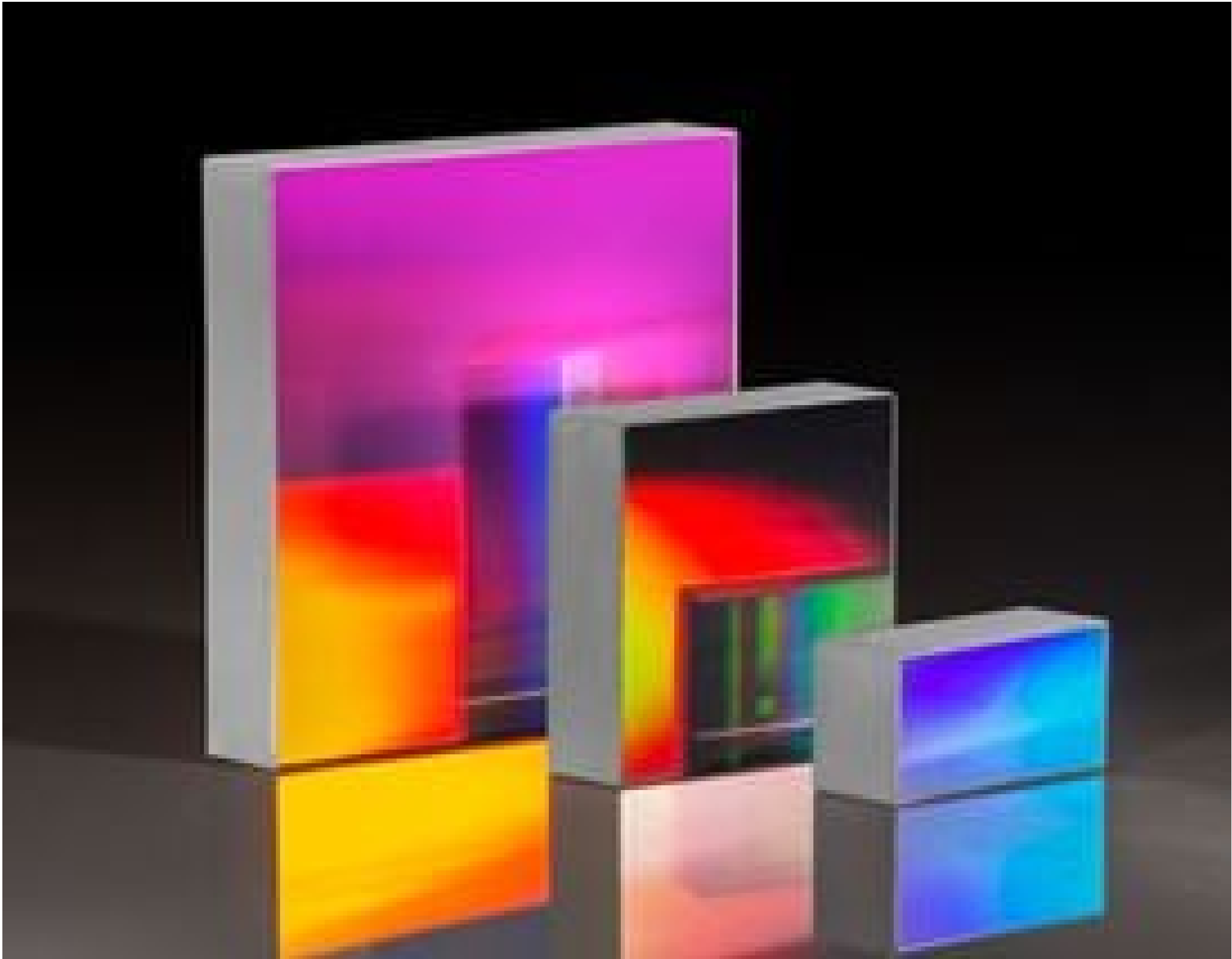
Reflective Ruled Diffraction Gratings