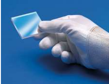
Component Handling Tools

These optics require special handling to avoid damage and ensure long-term performance. Proper handling, cleaning, and storage are essential to maintain optical quality. Explore our Optics Cleaning Resources for step-by-step guides and best practices. For personalized assistance, Email us or Chat with our technical support team.