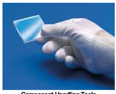
Component Handling Tools

These optics require special handling to avoid damage and ensure long-term performance. Proper handling, cleaning, and storage are essential to maintain optical quality. Explore our Optics Cleaning Resources for step-by-step guides and best practices. For personalized assistance, Email us or Chat with our technical support team.