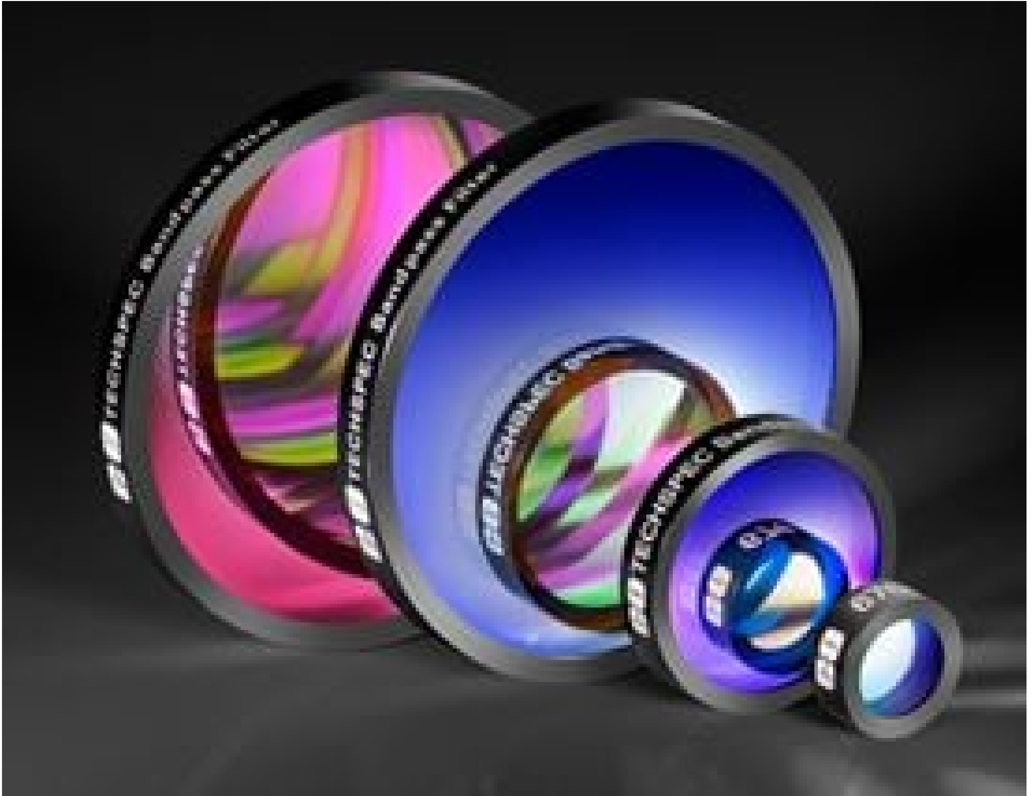
TECHSPEC Hard Coated OD 4.0 10nm Bandpass Filters