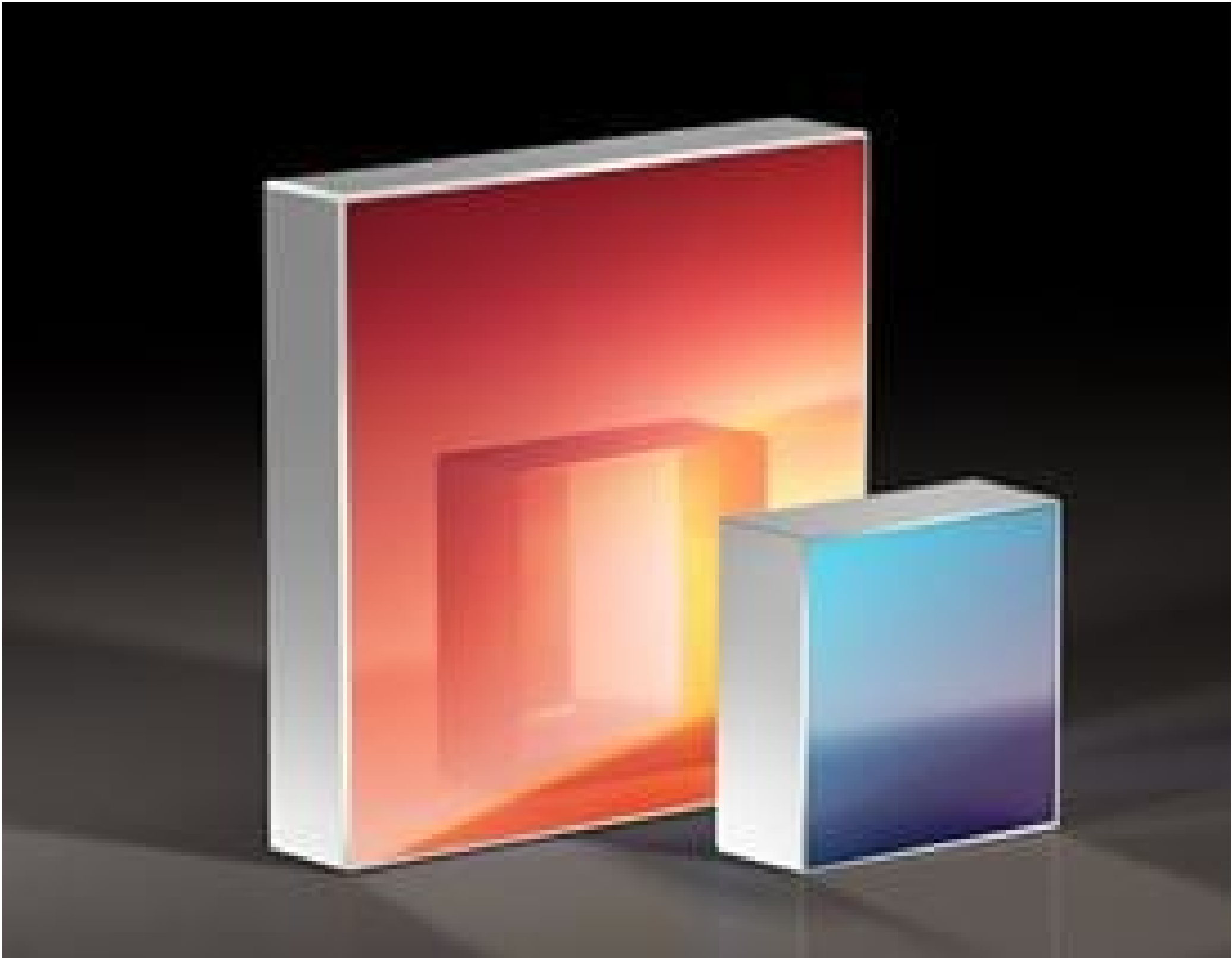
Reflective Holographic Gratings