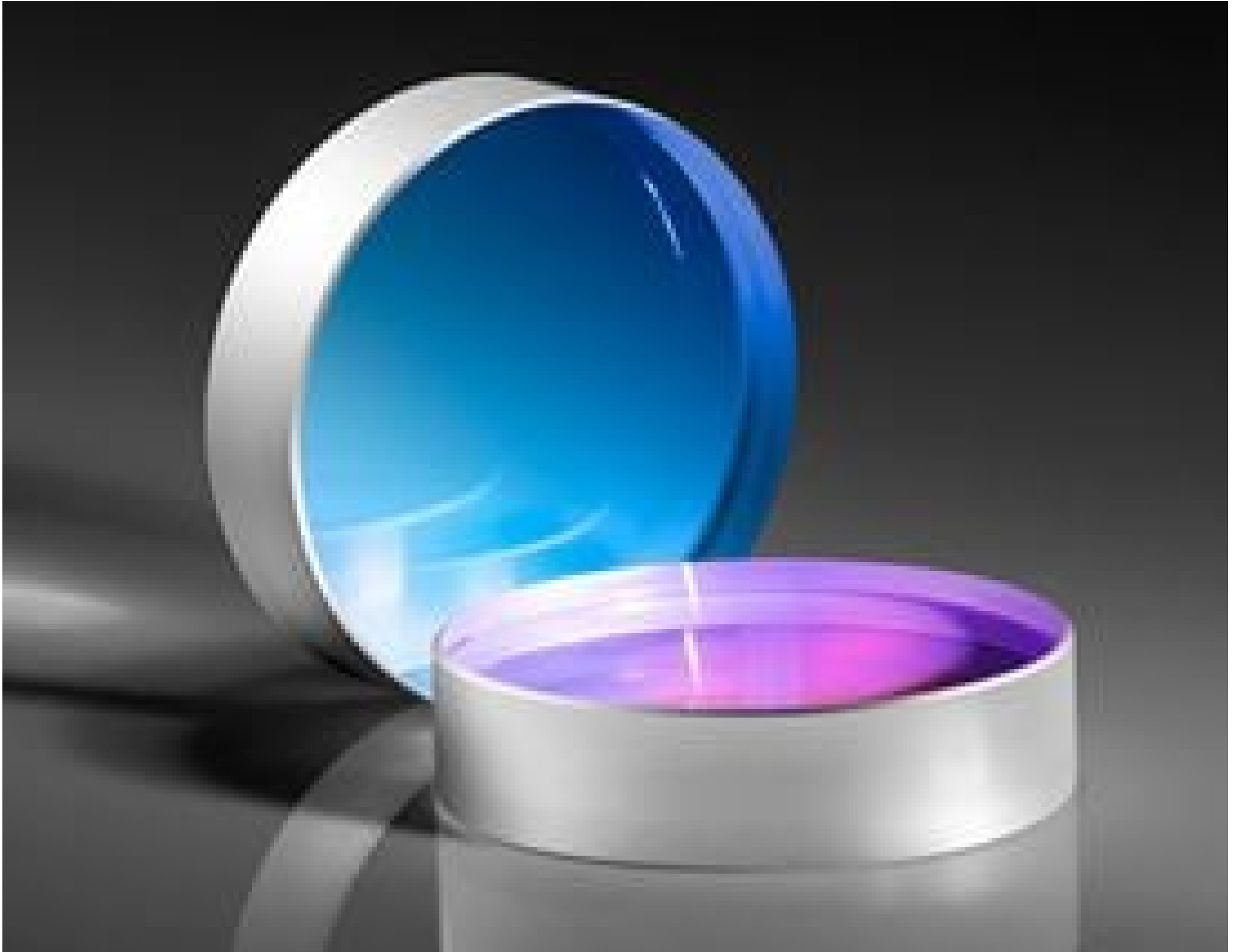
TECHSPEC® Nd:YAG Laser Line Beam Samplers