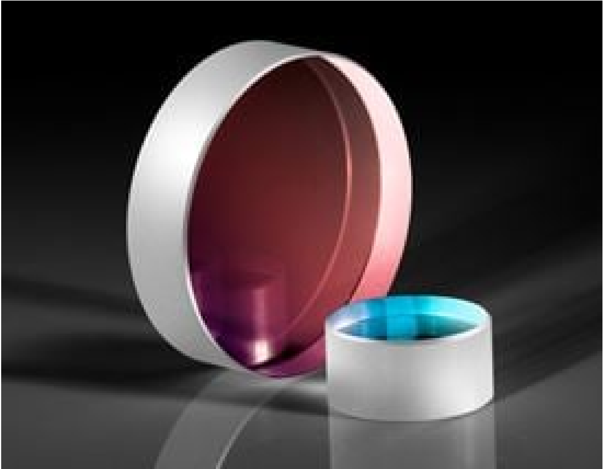
\lambda/10 Ultra-Low Reflectivity Windows