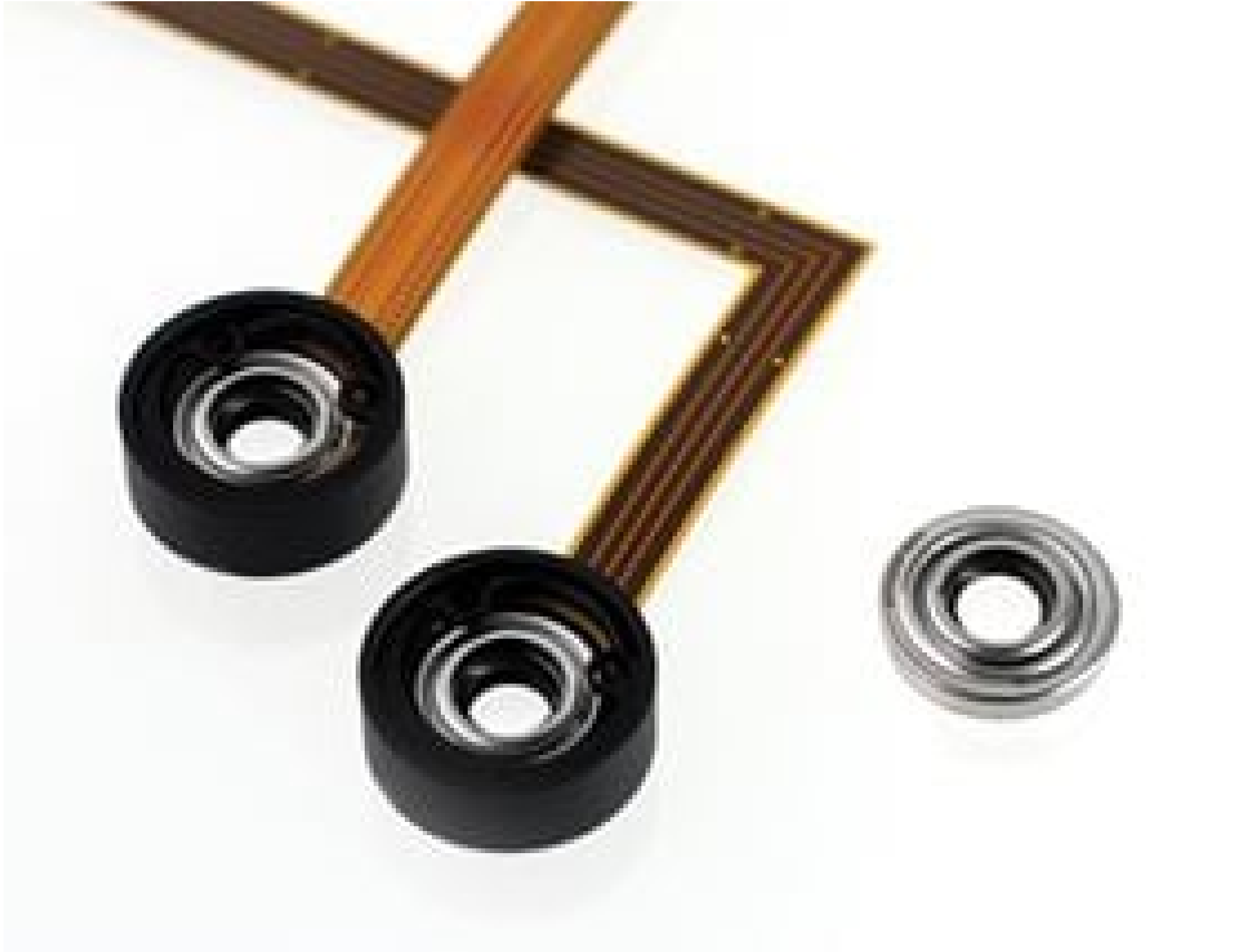
Corning® Varioptic® Variable Focus Liquid Lenses