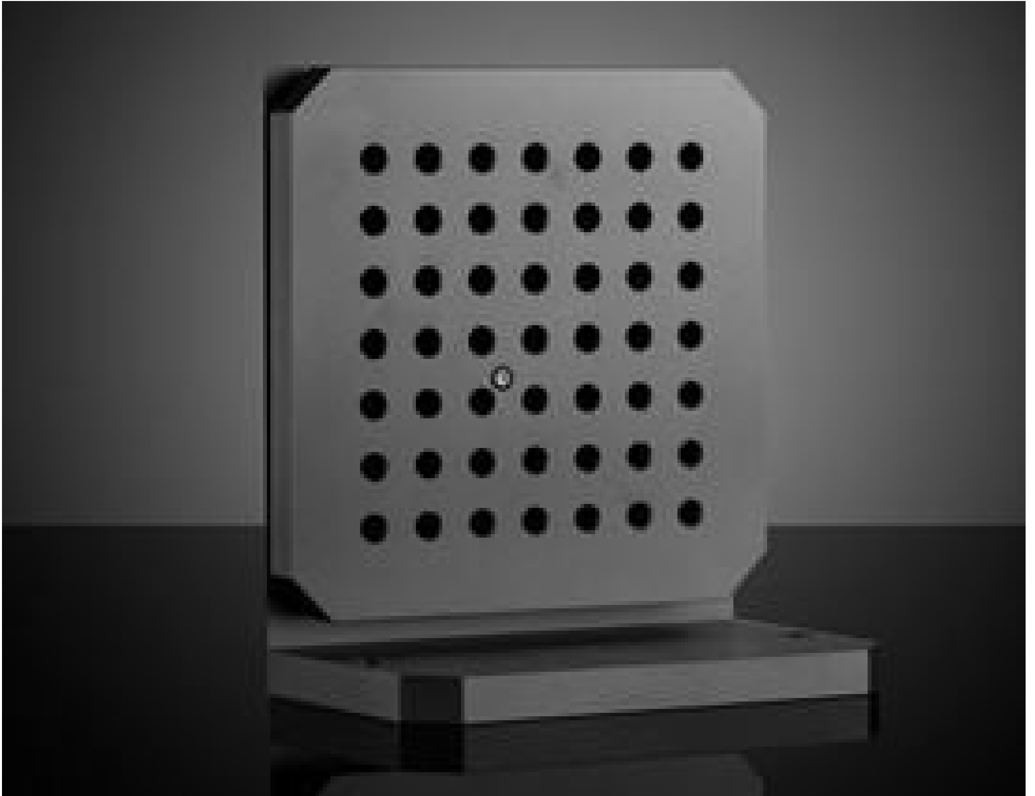
4.5" Angle Mirror Mount