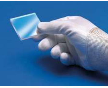
Component Handling Tools