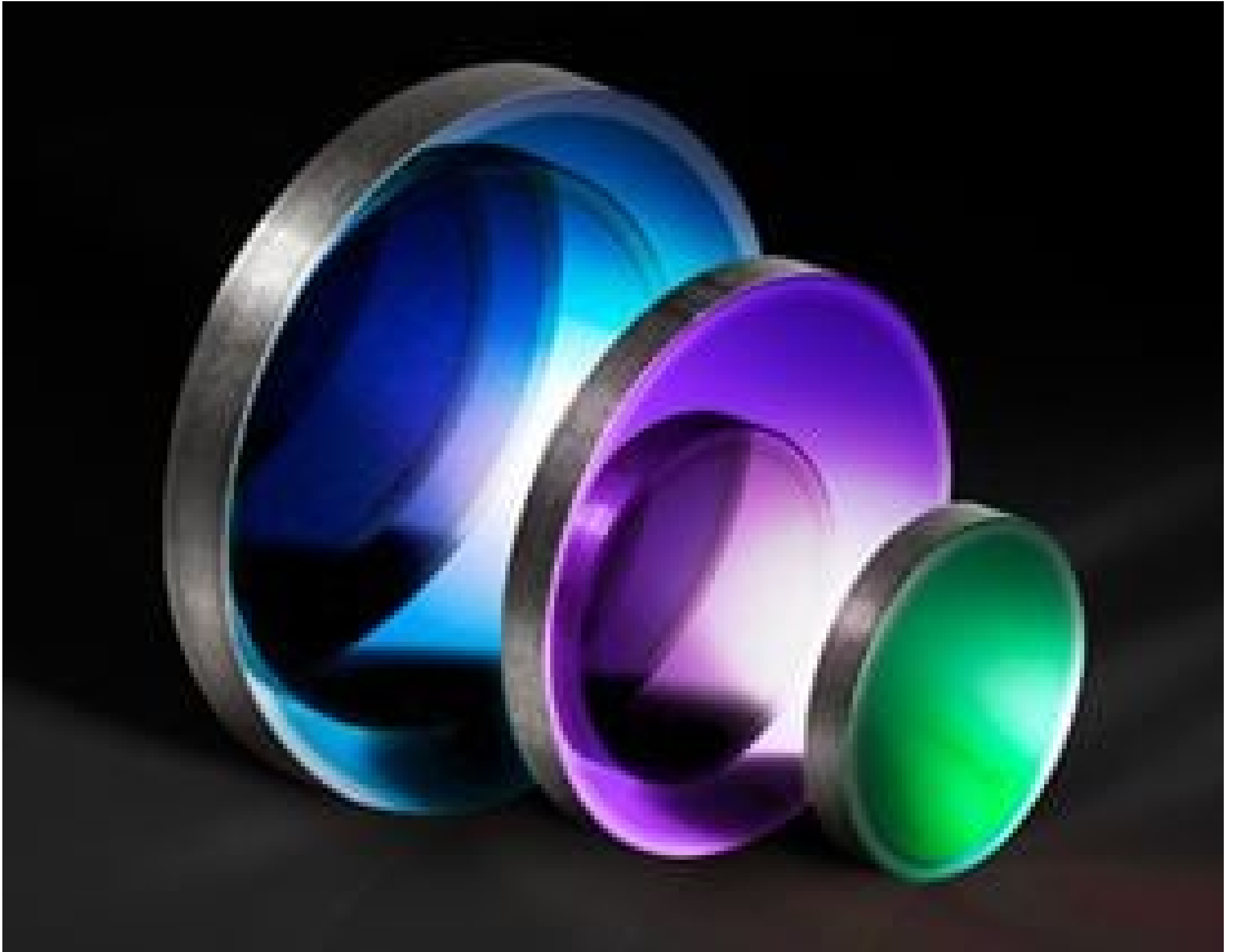
Germanium (Ge) Windows