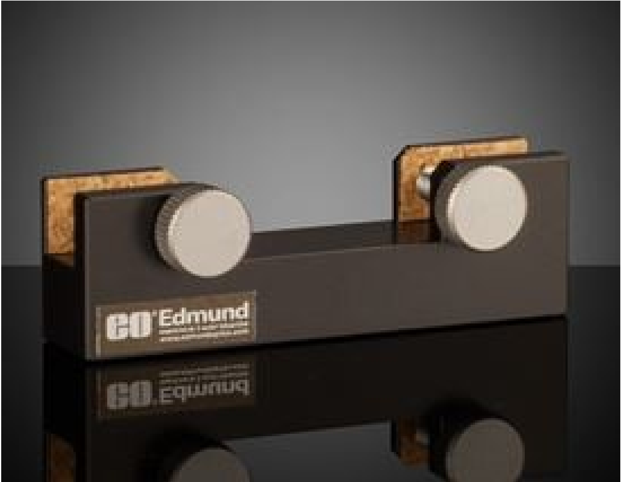
40mm Sq., Fixed Filter Holder