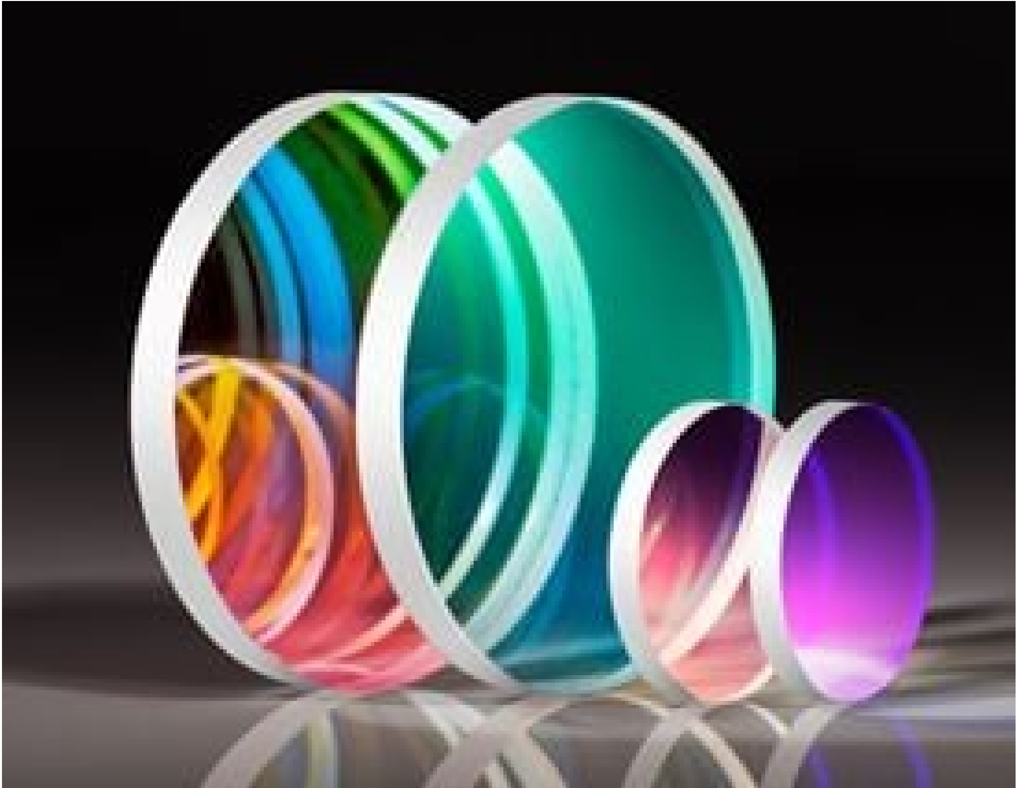
High Performance OD 4.0 Shortpass Filters