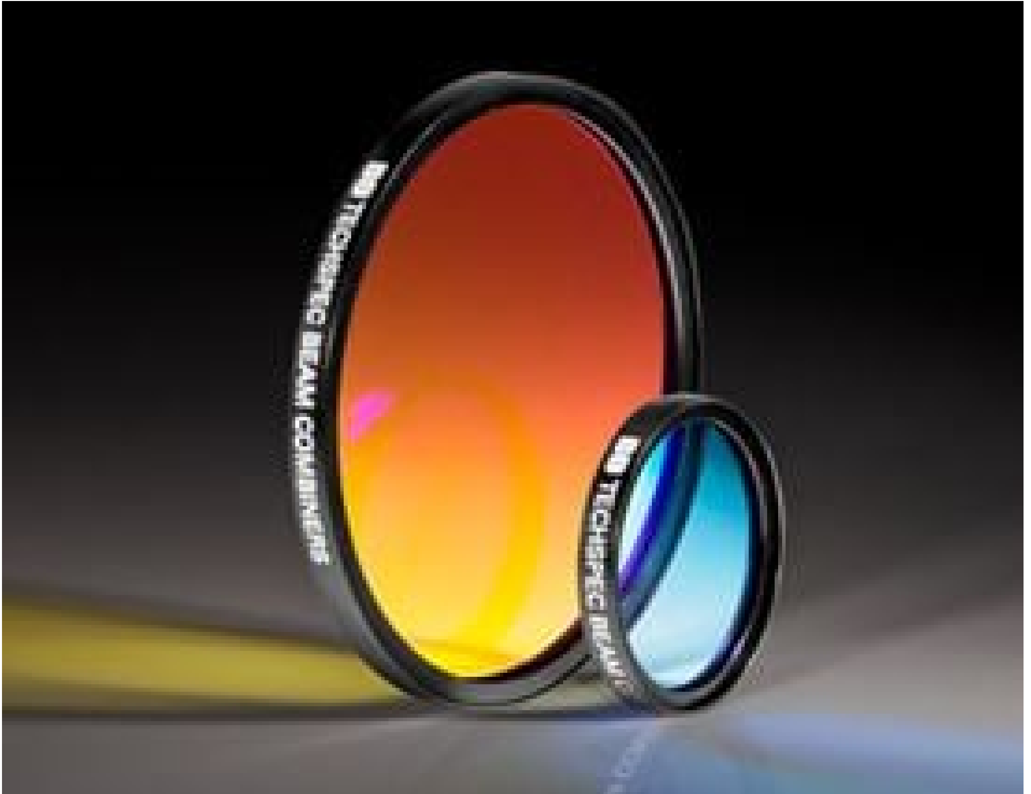
TECHSPEC® Dichroic Laser Beam Combiners