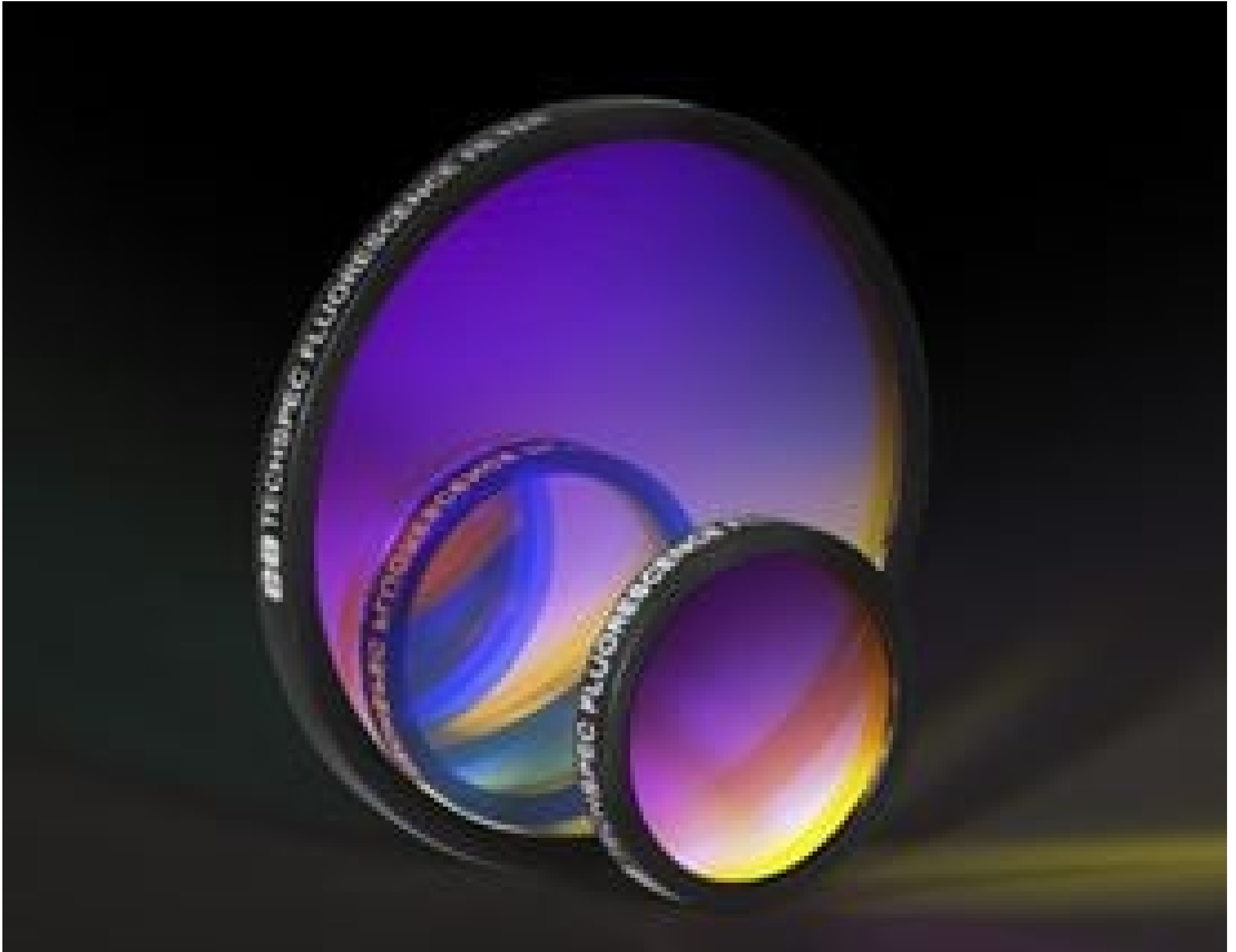
Multi-Band Fluorescence Bandpass Filters