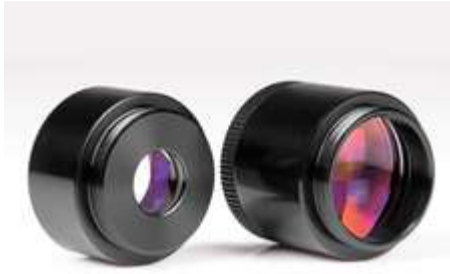
C, S, and T-Mount Circular Optic Mounts