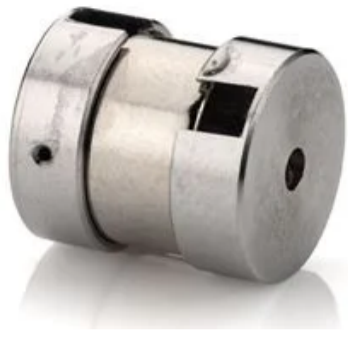
Mini Free-Space Optical Isolators