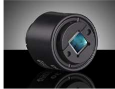
Free-Space Optical Isolators