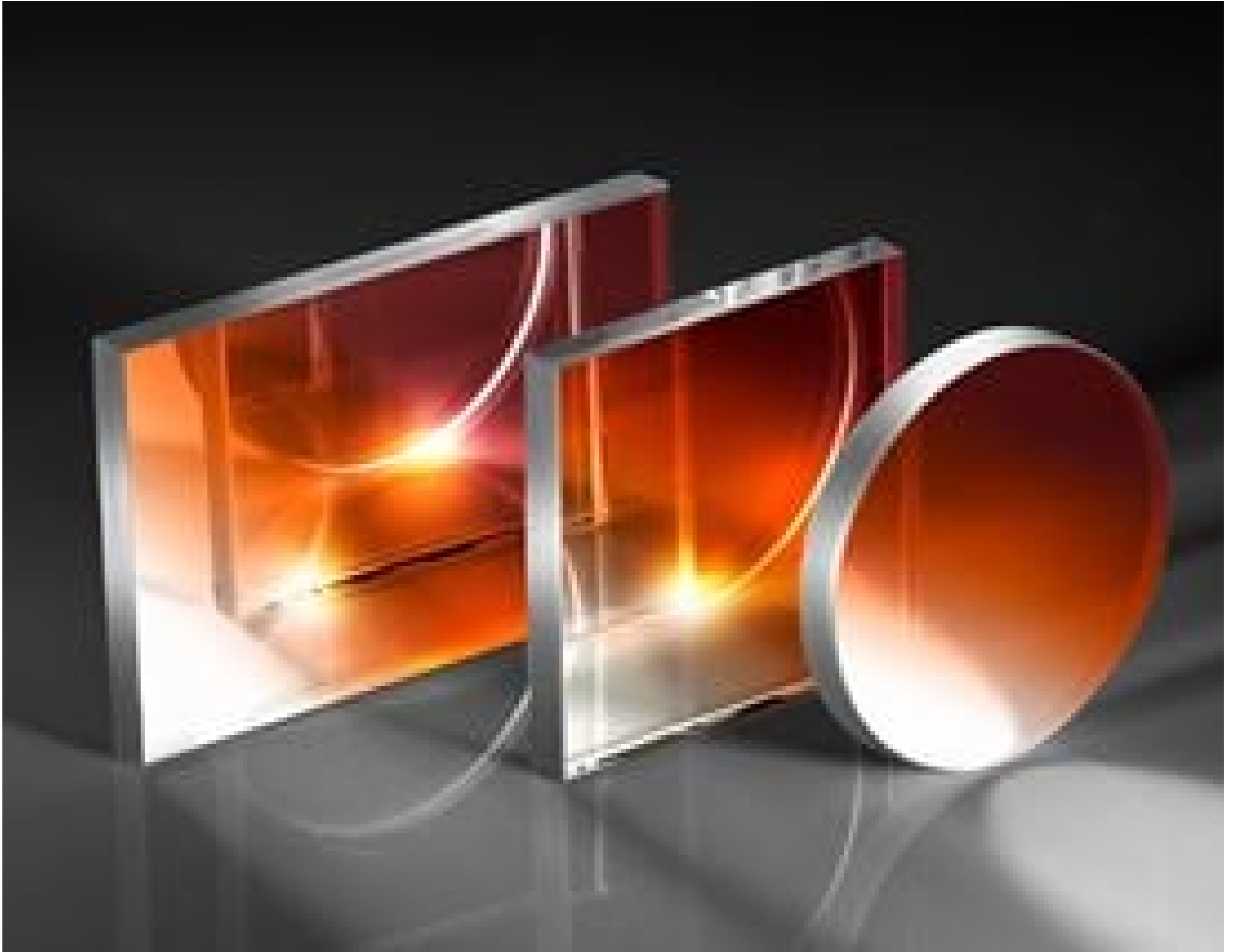
Visible and NIR Plate Beamsplitters