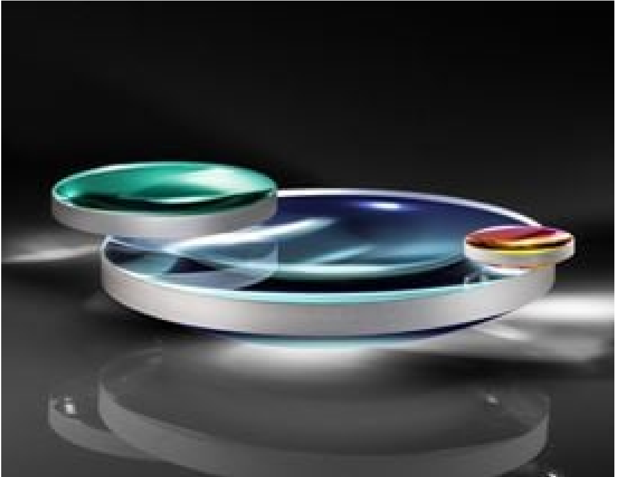
633nm Laser Line Coated Plano-Convex(PCX) Lenses