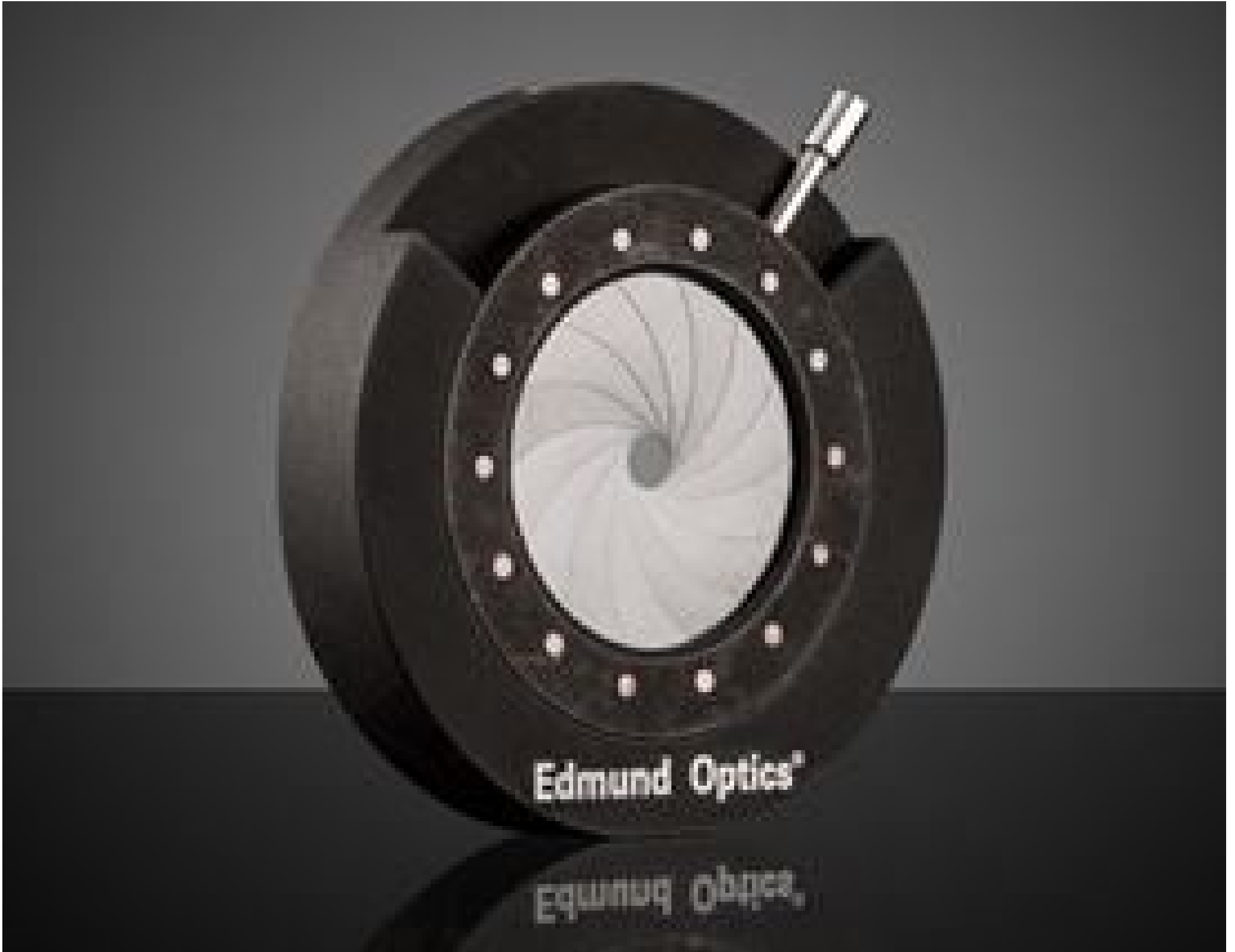
50.8mm Outer Diameter, Mounted Iris Diaphragm, #53-915