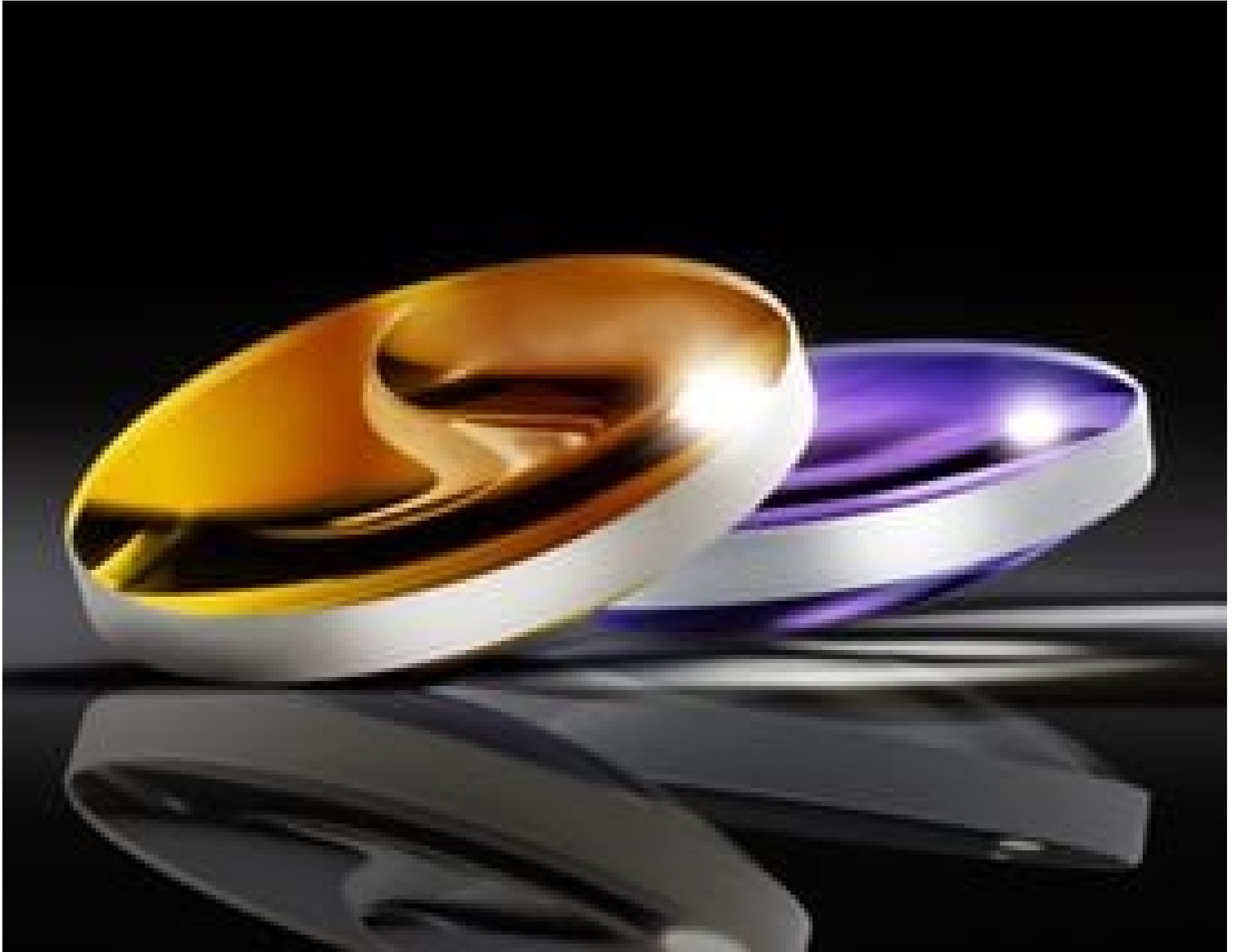
High Precision Laser Grade Aspheric Lenses