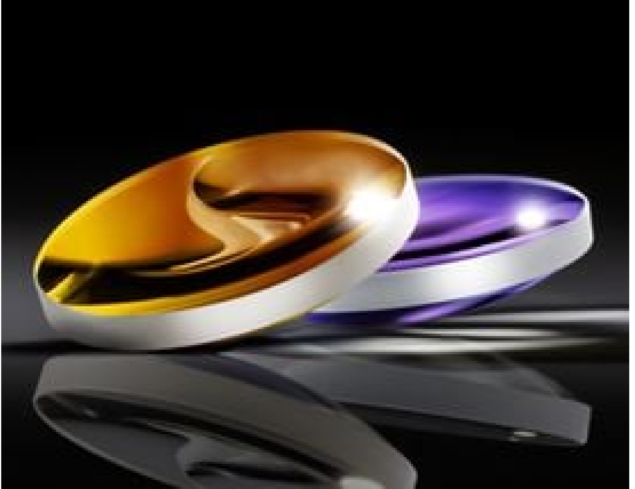
High Precision Laser Grade Aspheric Lenses