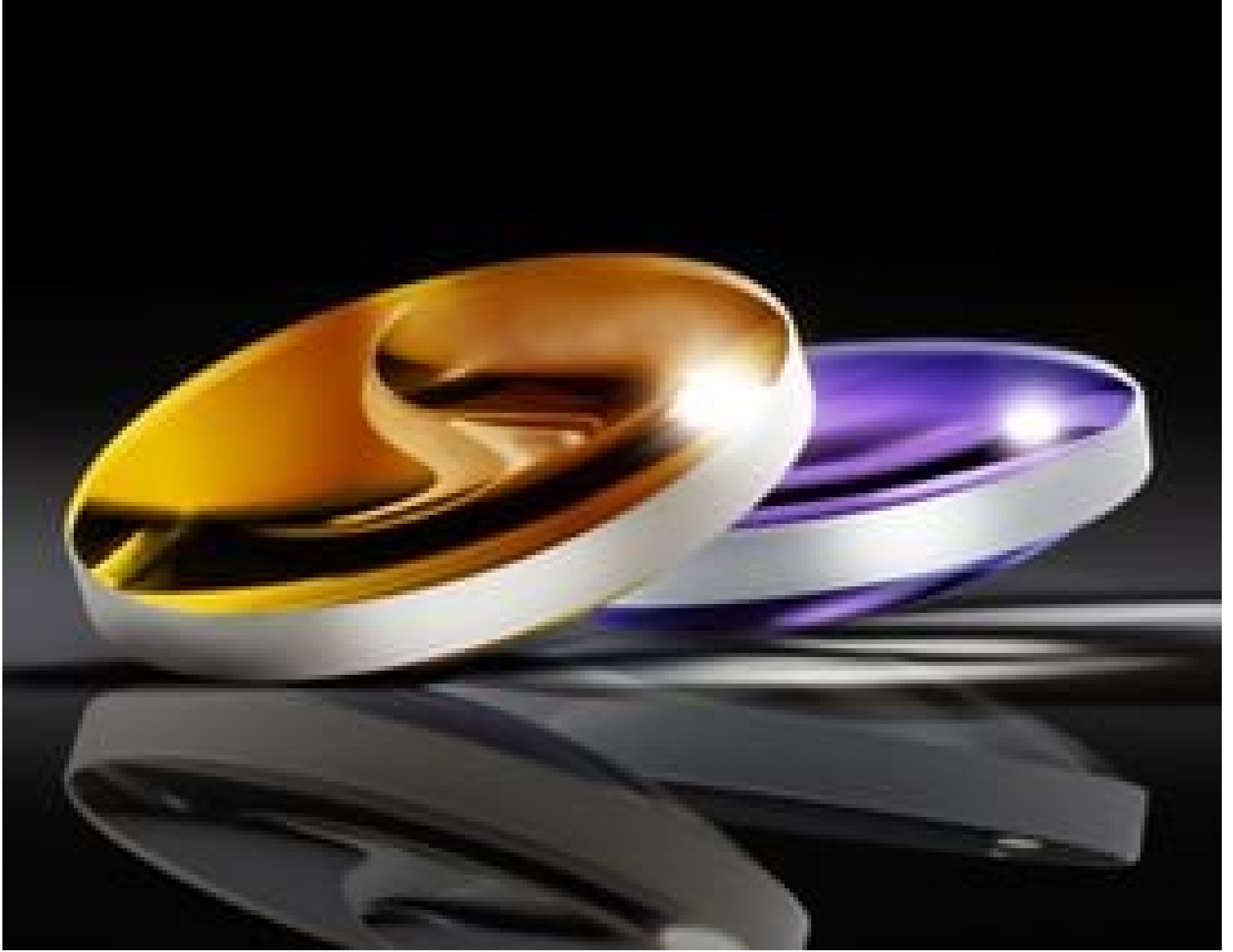
High Precision Laser Grade Aspheric Lenses