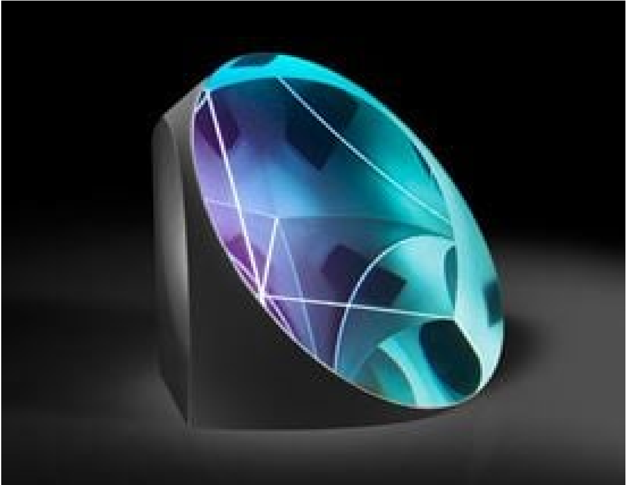
N-BK7 Corner Cube Retroreflectors with Black Overpaint