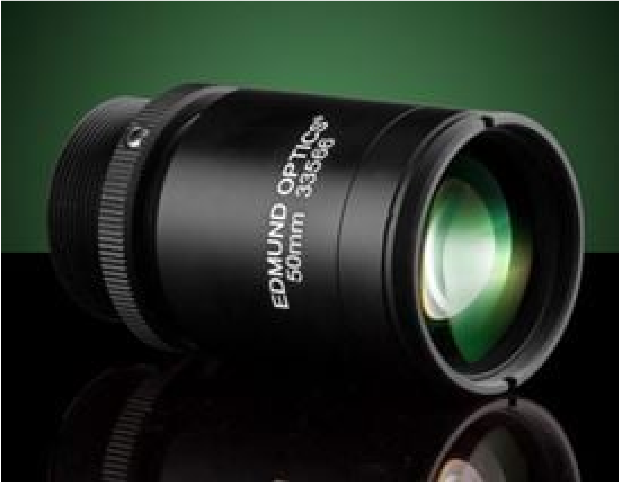
50mm Cx Series Fixed Focal Length Lens, #33-566