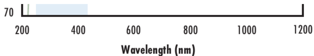
Fused Silica with UV-VIS Coating Typical Transmission