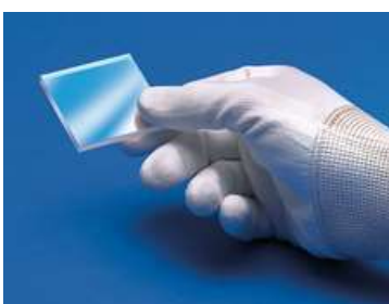
Component Handling Tools

These optics require special handling to avoid damage and ensure long-term performance. Proper handling, cleaning, and storage are essential to maintain optical quality. Explore our Optics Cleaning Resources for step-by-step guides and best practices. For personalized assistance, Email us or Chat with our technical support team.