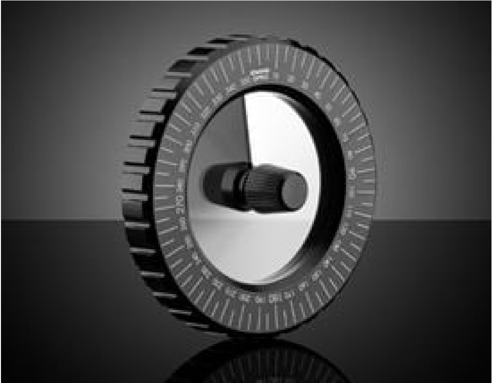
Mounted Circular Variable Neutral Density (ND) Filters